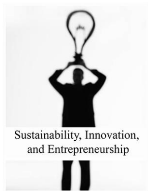
Sustainability, Innovation, and Entrepreneurship