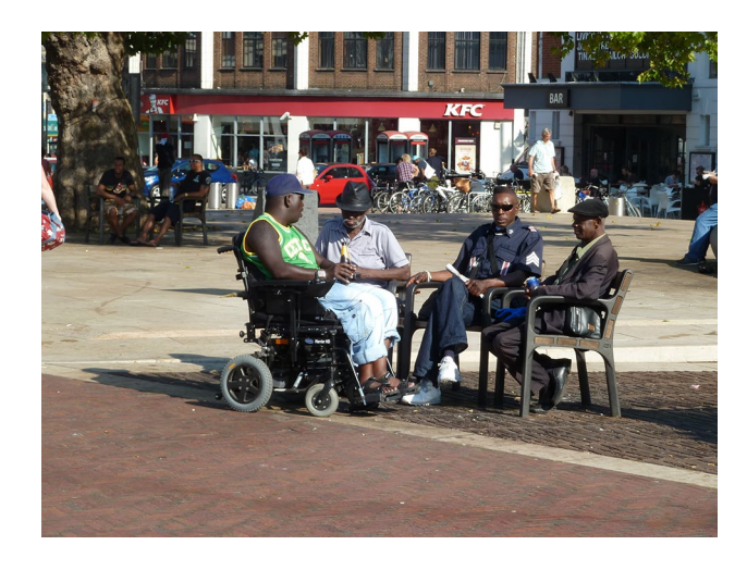
Fig. 1 Windrush Square, Brixton: Boris Johnson also benefitted hugely from the legacy of work on public spaces conduced during the Livingstone era, as, like the gift that keeps on giving, public space projects continued to mature throughout the austerity years (Matthew Carmona)

The third mayor—Sadiq Khan—has promised to continue the focus on public spaces although with a stronger environmental emphasis directed at reducing pollution, clutter and congestion, and improving design.<sup>2</sup> Begun under Johnson but significantly bolstered from 2016 under Khan, much of the discussion on London's streets and spaces is increasingly seen in health terms, with the launch of Healthy Streets for London in early 2017 formalising a range of initiatives into