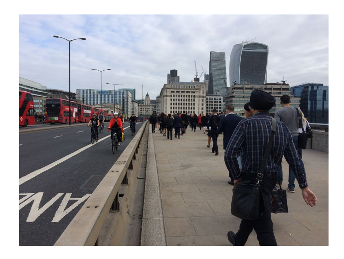
Fig. 15 Barriers installed on some Thames bridges following the London terror attacks of 2017 (Matthew Carmona)

in London with its history of IRA attacks from 1971 through to 2001, and radical Islamist attacks starting not long afterwards through to 2017. Shootings in 2015 in Copenhagen had similar ideological roots, whilst the 2011 bombing of government offices in Oslo and subsequent massacre on Utøya island had very different far right roots. Given these attacks and numerous other smaller or thwarted attacks in the four cities covered in this paper, it is surprising that security measures are, in general, so absent.