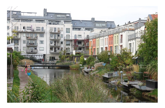
Fig. 9 Western Habour, with its carefully designed public (and private) spaces

site of the former Carlsberg breweries into a mixed urban neighbourhood since 2006, but following the collapse of the housing market in 2009 alternative strategies to activate and 'brand' the area were introduced through a new temporary public space strategy. The public initiative Kickstart København (2010, p. 11) supported the initiative financially with the intention "to create life and activity for the residents in the area until the construction of a new city district" (Fig. 8). The resulting spaces became very popular and were promoted for their experimental approach to urban design (Hausenberg et al. 2011). Later, independently funded activities moved into the area including a climbing obstacle course, a container city flea market, a beach bar, and a range of cultural institutions; all helping to give rise to a distinct Carlsberg culture. Once the market took off again and development activities kicked off, most of the temporary projects