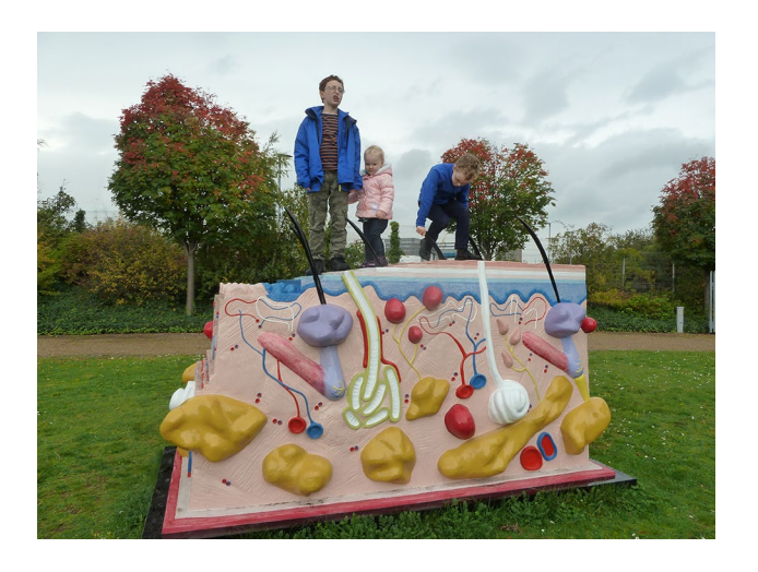
Fig. 14 The Line art walk, from the O2 to the Queen Elizabeth Olympic Park, here Damien Hirst's Sensation acting as an unintended plaything

(City of Copenhagen 2015c). The political ambition of the Community Copenhagen strategy aims to promote greater local engagement and democratic processes but also to achieve increased citizen responsibility for public spaces. While not expressed in the strategy, there is also an ambition to reduce the cost of maintenance by encouraging more citizen-driven caretaking.