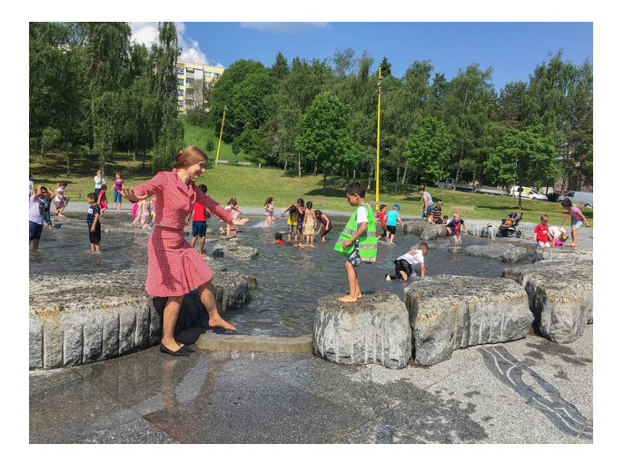
Fig. 12 Verdensparken (World park), Furuset, an upgrading of postwar green space to create a park attractive to different uses and the area's multi-cultural inhabitants, all based on an exemplary participatory design process (Kommunal - og Moderniserings Departementet, Ministry of Modernization and Local Democracy)

Since 2008, demonstrations against austerity politics in Europe have reconfirmed the critical democratic role of public space. In London, protest and demonstration remains a regular occurrence, with the Occupy and Stop the War camps of 2011/12 forcefully re-asserting the historic role of public space for demonstration and political purposes (Tonkiss 2013, p. 315). Eventually, the legal limits of such protests were tested in the courts and the camps began to disappear as legislation effecting Parliament Square was redefined<sup>12</sup> and elsewhere rights to protest and of association under the 1998 Human Rights Act were shown not to extend to the right to occupation. Consequently, the early light touch policing and tolerance of such activities, which were largely peaceful, has been replaced with more active and rapid intervention as and when deemed necessary. By contrast, the rights and wrongs of the 2011 riots which affected large parts of London in a far more dramatic and disturbing manner remain contested. Under Mayor Boris Johnson they nevertheless helped to drive significant public funds in the direction of the most affected areas, much of which was focussed on improvements to the physical built environment of the spaces that had been targeted.