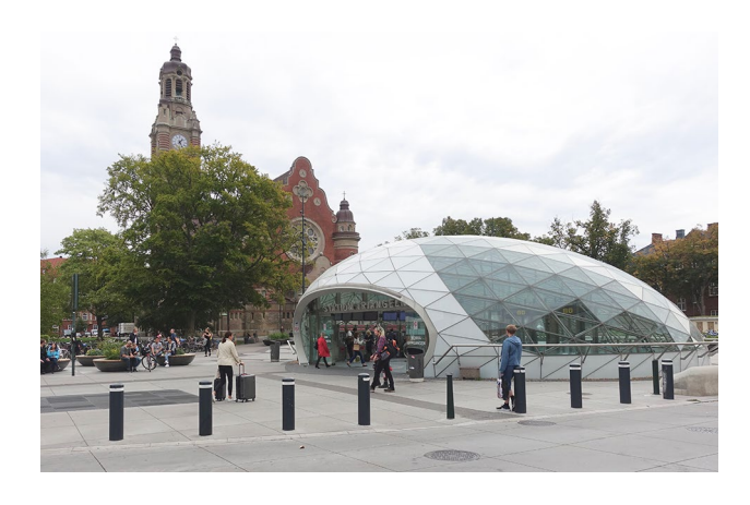
Fig. 2 Triangeln, Möllevången: a new public space dating from 2010 in the centrally located dense working class district of Möllevången (Matthew Carmona)

that have been acknowledged internationally for their quality (Fig. 2), and that have helped to attract high-income groups from surrounding municipalities. During the 2000s, municipal investments in technical infrastructure amounted to around two billion SEK each year (from a total annual municipal budget of 17 billion SEK—Malmö stad 2016). To finance this, the city sold the Sydkraft public power plant (Holgersson 2014, p. 10) and utilised money from the pension fund set aside for its pre-1998 employees.<sup>4</sup>