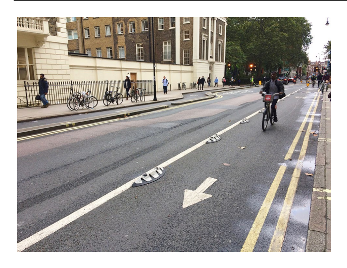
Fig. 7 Exploratory cycleway layouts (to the right of the image) in London's Bloomsbury, implemented at minimal cost prior to more permanent investments (to the left of the image) being made (Matthew Carmona)