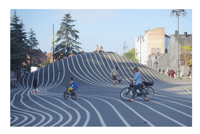
Fig. 4 Superkilen features a daring design through its bright red urban carpet, black plaza and green belt, each furnished with urban elements from around the word mirroring the multi-cultural population of the neighbourhood (Matthew Carmona)