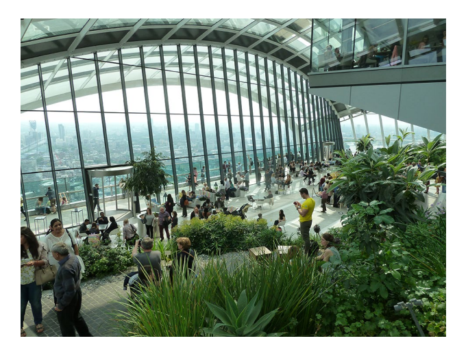
Fig. 5 The new 'public space'—Sky Garden—on top of the Walkie Talkie tower negotiated as part of the planning permission. Free to enter, but you need to book in advance, obtain a ticket, and pass through security (Matthew Carmona)

In London, playing on the then Mayor's love of the dramatic (he funded, for example, the Emirates Air Line cable