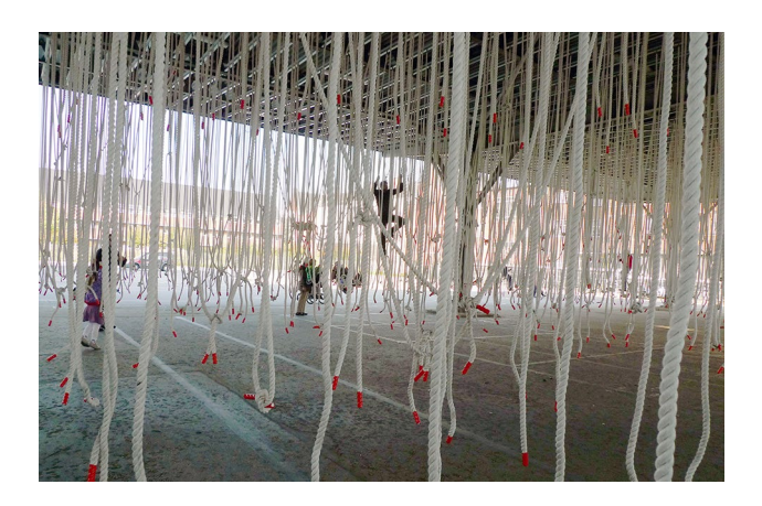
Fig. 8 In the Rope Forest, an open space underneath a large roof construction was filled with gymnastic ropes (Anne Wagner)

site of the former Carlsberg breweries into a mixed urban neighbourhood since 2006, but following the collapse of the housing market in 2009 alternative strategies to activate and 'brand' the area were introduced through a new temporary public space strategy. The public initiative Kickstart København (2010, p. 11) supported the initiative financially with the intention "to create life and activity for the residents in the area until the construction of a new city district" (Fig. 8). The resulting spaces became very popular and were promoted for their experimental approach to urban design (Hausenberg et al. 2011). Later, independently funded activities moved into the area including a climbing obstacle course, a container city flea market, a beach bar, and a range of cultural institutions; all helping to give rise to a distinct Carlsberg culture. Once the market took off again and development activities kicked off, most of the temporary projects