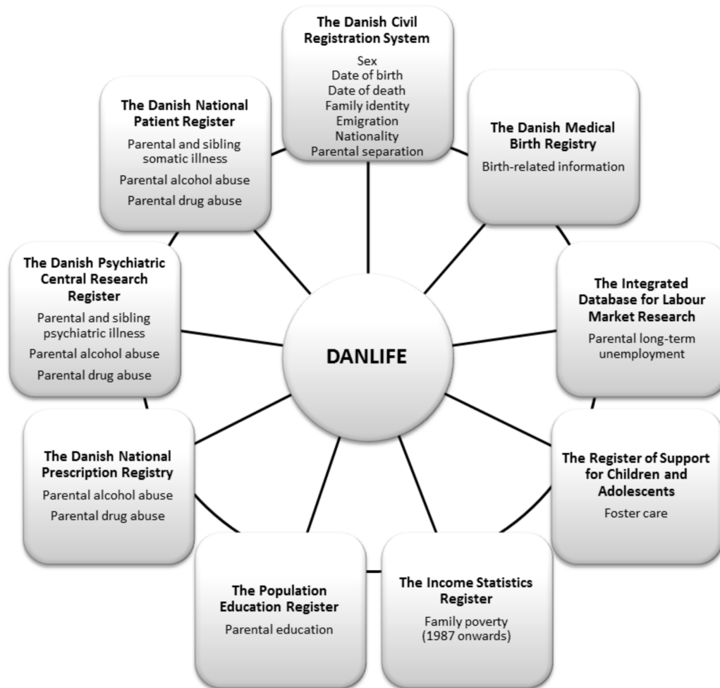
Figure 1 Nationwide Danish registers linked on individual level in the DANish LIFE course (DANLIFE) cohort using the Civil Personal Registration number and the information they provided to the cohort.

the population nor is an ethical approval by the Danish National Committee on Health Research Ethics required.