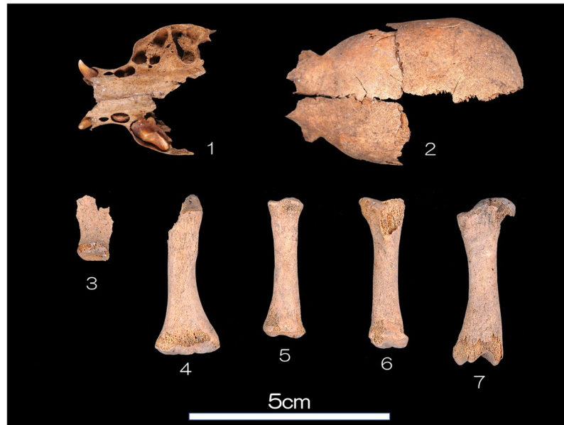
Figure 1. Photo of the main bones of neonatal dog skeleton (2017HA1016): (1) maxilla and frontal; (2) parietal; (3) scapula R; (4) humerus L; (5) radius R; (6) tibia R; (7) femur R.