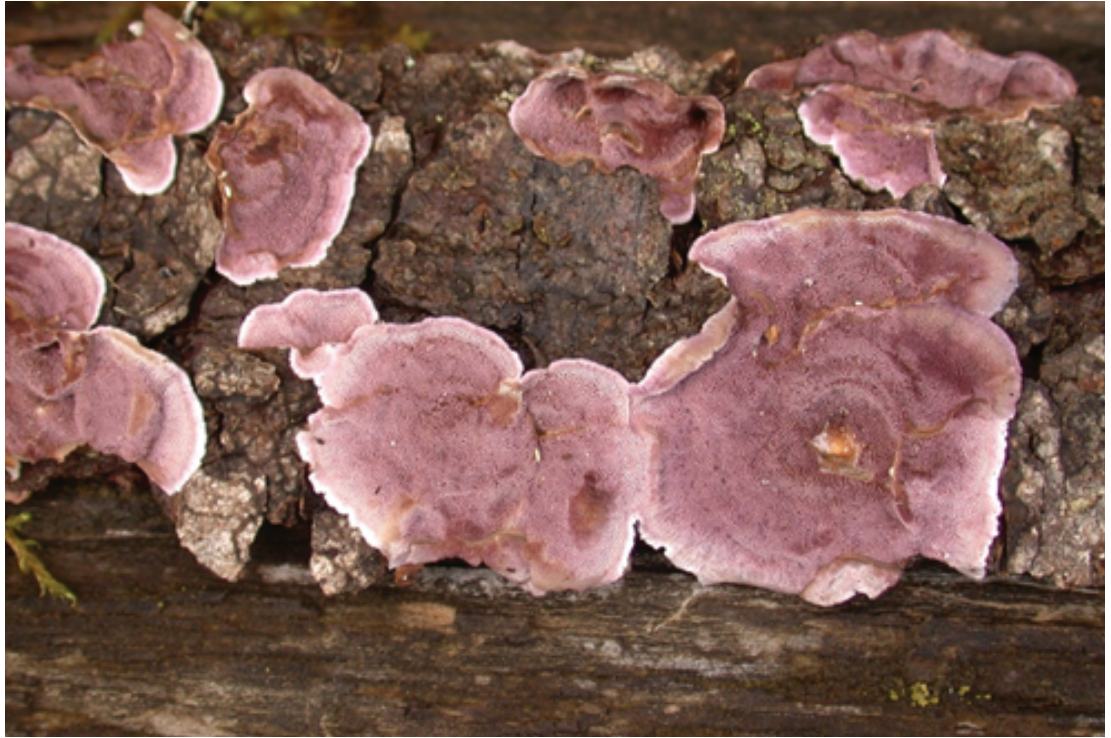
Figure 2: Skeletocutis lilacina . P. Corfixen 97.159; photo by H. Knudsen.

three localities. The same situation occurs in the Magadan region, where the greatest diversity of fungi on P. pumila was found in the vicinity of the village of Yagodnoe (8 species) and in the Snowy Valley (9 species): only T. fuscoviolaceum is present in both localities (Table 2).