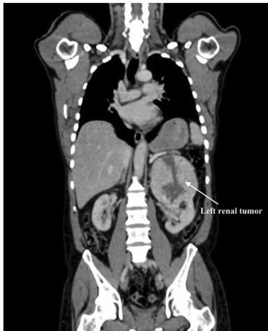
FIG. 1. Twelve centimeter tumor on the upper pole of left kidney.

recently started to feel pain in the left hypochondria. The patient had not experienced hematuria.