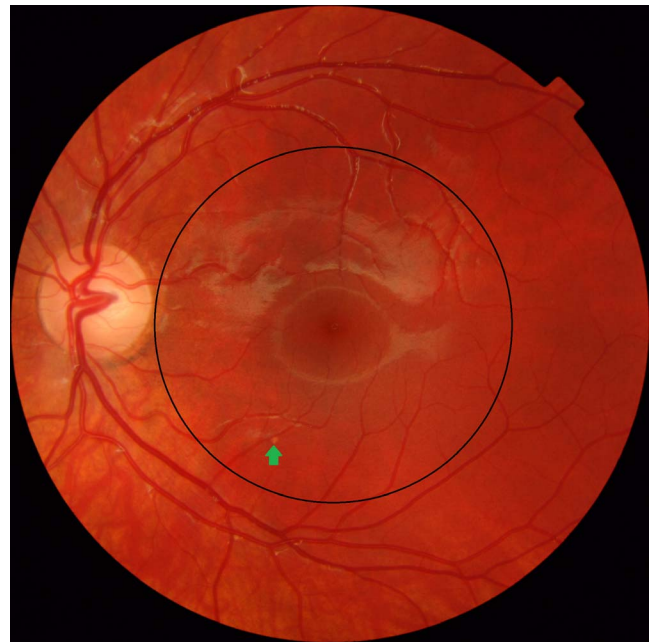
FIGURE 1. Forty-five-degree color fundus photograph of an 11-year-old participant from the CCC2000 Eye Study. A circle (black) centered on the fovea with a radius stretching to the temporal rim of the optic disc was used to define the macular area. In this case a bright fundus element of greatest linear dimension larger than 63 μm is seen (green arrow). It is the only example of a drusen-like element larger than 63 μm in the present study. Other bright areas seen in this photograph are fundus reflexes.

Spectral-domain optical coherence tomography (OCT, Spectralis HRA-OCT; Heidelberg Engineering, Heidelberg, Germany) was made with emphasis on enhanced-depth imaging mode scans. The protocol included a seven-line horizontal pattern and a four-line radial pattern, both centered