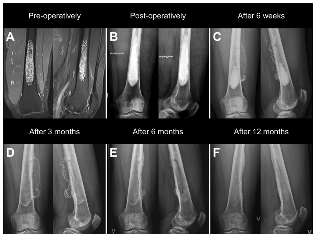
Figure 3. A patient treated by curettage and defect filling, using a combination of CERAMENT[G (20mL) and CERAMENT[BONE VOID FILLER (36mL) via an extended cortical window, for a large enchondroma in the left distal femur. (A) Pre-operative MRI-scan. (B) Post-operative x-ray without product-leakage (C,D) X-rays after 6 weeks and 12 weeks showing soft-tissue leakage. (E) X-ray after 6 months showing almost complete resorption of soft-tissue leakage. Outline of the bone window is clearly visible. (F) X-ray after 12 months showing complete resorption of the soft-tissue leakage, blurring of the bone window, and thickening of the posterior and lateral cortex.

developed a calcification in the trochanteric bursa after treatment of a bone defect in the proximal femur. No leak of bone-graft substitute was seen in this patient.