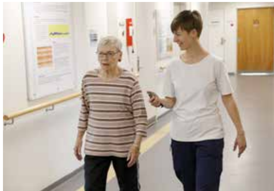
Gait speed testing.

function) [11]. Despite these initiatives and the severe consequences of sarcopenia, a widespread clinical use of the concept is still lacking, and the European algorithm for assessing sarcopenia has not yet been fully implemented in geriatric clinical practice in Denmark.