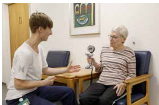
Hand-grip strength testing.