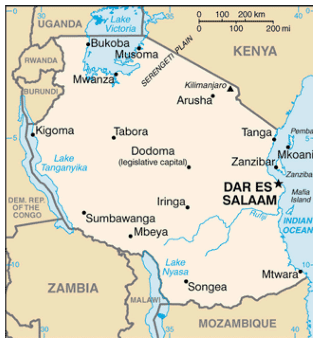
Figure 1 Map of Tanzania 32 showing location of Dar es Salaam.

This paper is based on a qualitative study embedded in a randomised trial called Connected2Care (NCT02509702). The trial aims to assess the effect of short message service (SMS) on attendance at a health-provider initiated cervical cancer follow-up screening among women, who have tested HPV-positive during a patient-initiated screening. Both the patient-initiated and health provider-initiated screening entailed a gynaecological examination. The trial started in 2015 and is to finish in 2018. The study protocol is published elsewhere. 9