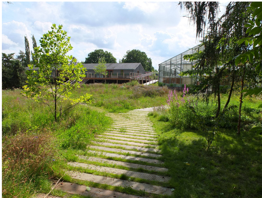
Figure 2. The picture shows a view from the therapy garden, Nacadia.