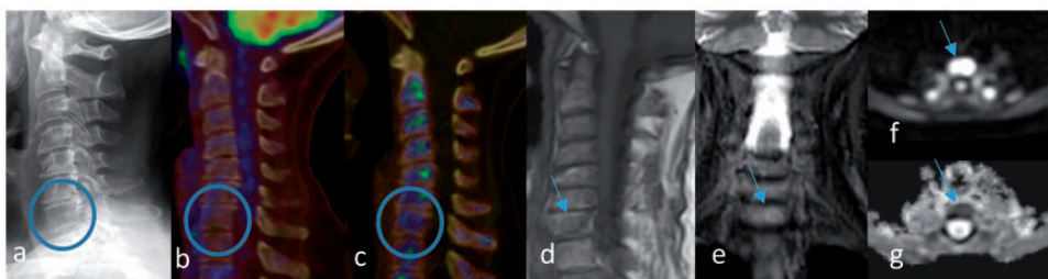
Fig. 2. A 61-year-old woman with newly diagnosed multiple myeloma. A lesion in the body of C7 is detected on whole-body 3T MRI only (arrows). No C7 lesion is detected on (a) whole-body X-ray, (b) FDG-PET/CT, or (c) NaF-PET/CT (circles). The C7 lesion is detected on all four MRI sequences with findings indicative of a myeloma bone lesions (arrows): (d) hypointense on coronal T1W imaging, (e) hyperintense on coronal STIR, (f) high signal intensity on DWI b1000, and (g) low signal intensity on axial ADC. ADC value is 0.52 \times 10^{-3} \text{ mm}^2/\text{s} (SD = 0.1).

the rim of the lesions corresponding to osteoblast activity (Fig. 1c) (10–12).