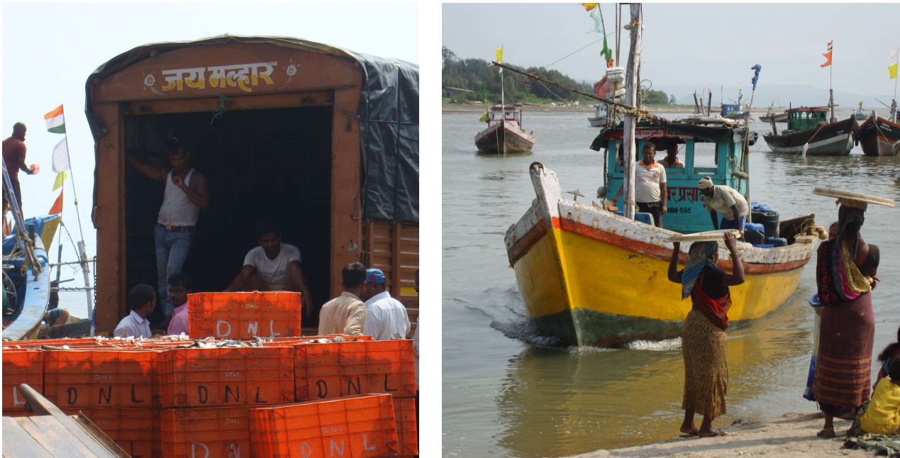
Figure 1. The landing center in Alibaug.