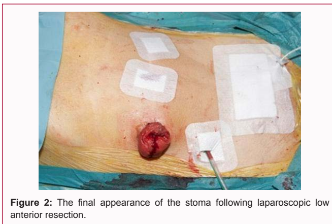
Figure 2: The final appearance of the stoma following laparoscopic low anterior resection.

6, 9 and 12 o'clock allowing eversion of the stoma (Figure 1D). The stoma should protrude 2-3 cm above the skin (Figure 2). The final step consists of placement of approximately eight absorbable sutures through the full thickness of the bowel wall but only through the skin dermis. The closure of the stoma is carried out in the following manner: A circumferential incision with electrocautery is made in the skin surrounding the stoma. The stoma is dissected free of the surrounding subcutaneous fat and fascia, down to the peritoneal cavity (Figure 3A). A functional end-to-end anastomosis is already present from the primary surgery. The ileostomy is closed with a linear stapling device (Figure 3B and 3C). After the closure of the fascia, the skin is close by purse-string sutures (3-0 PDS) (Figure 3D).