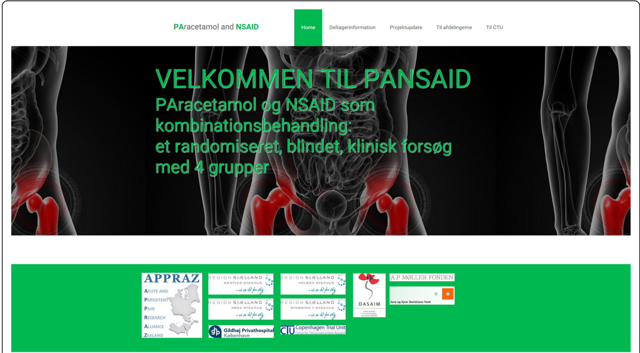
Fig. 3 Screenshot of the trial homepage, www.pansaid.dk