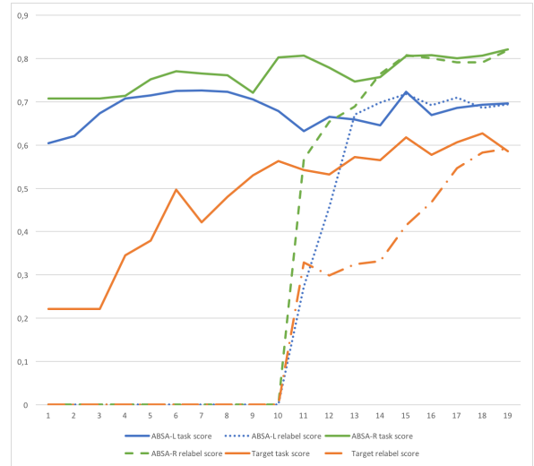
Figure 3: Learning curves with LTN for selected tasks, dev performances shown. The main model is pre-trained for 10 epochs, after which the relabelling function is trained.

model does not take long to converge as it has fewer parameters than the main model. Once the relabelling model is learned alongside the main model, the main model performance first stagnates, then starts to increase again. For some of the tasks, the main model ends up with a higher task score than the relabelling model. We hypothesise that the softmax predictions of other, even highly related tasks are less helpful for predicting main labels than the output layer of the main task model. At best, learning the relabelling model alongside the main model might act as a regulariser to the main model and thus improve the main model’s performance over a baseline MTL model, as it is the case for TOPIC-5 (see Table 5).