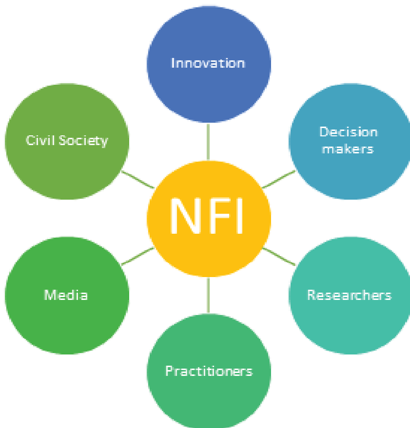
Figure 3: Telling the urban NFI story

Based on the workshop, we have identified the potential to change the view of civil society towards urban forests by combining (i) NFI-sourced information with (ii) expert knowledge on the challenges urban societies face.