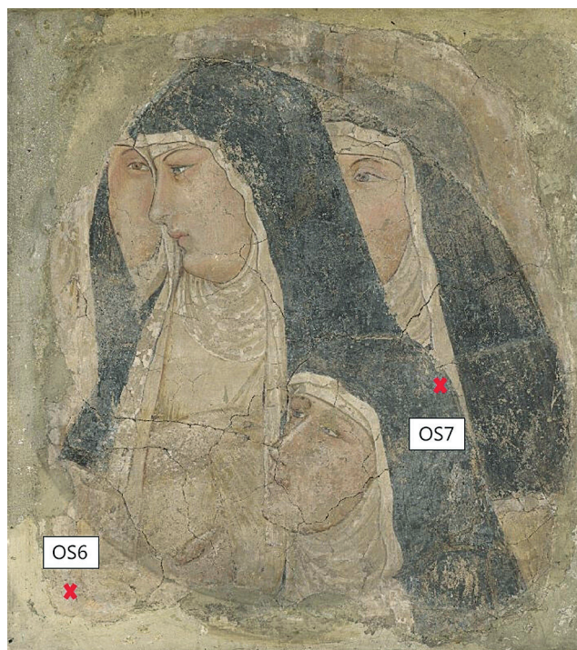
Figure 1. The wall painting "A Group of Four Poor Clares" by Ambrogio Lorenzetti (active 1319, died 1348/9), National Gallery, London. Sampling areas for proteomic analysis are indicated. Copyright The National Gallery, London.

Ambrogio Lorenzetti's A Group of Four Poor Clares (1336–40, National Gallery, London, NG1147; Figure 1) is a fragment of a wall painting, made using the fresco technique with areas of secco, in the Chapter House in San Francesco, Siena (Italy). The work was discovered under whitewash shortly before 1855 and the fragment was removed