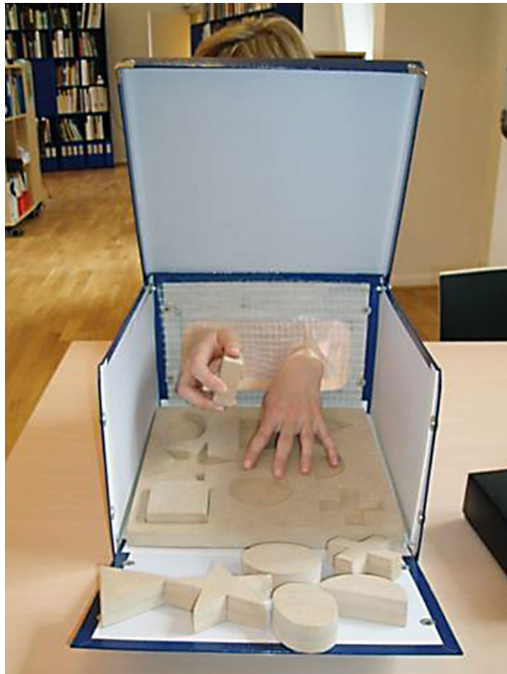
Fig. 1. All tactile subtests were performed using a box.