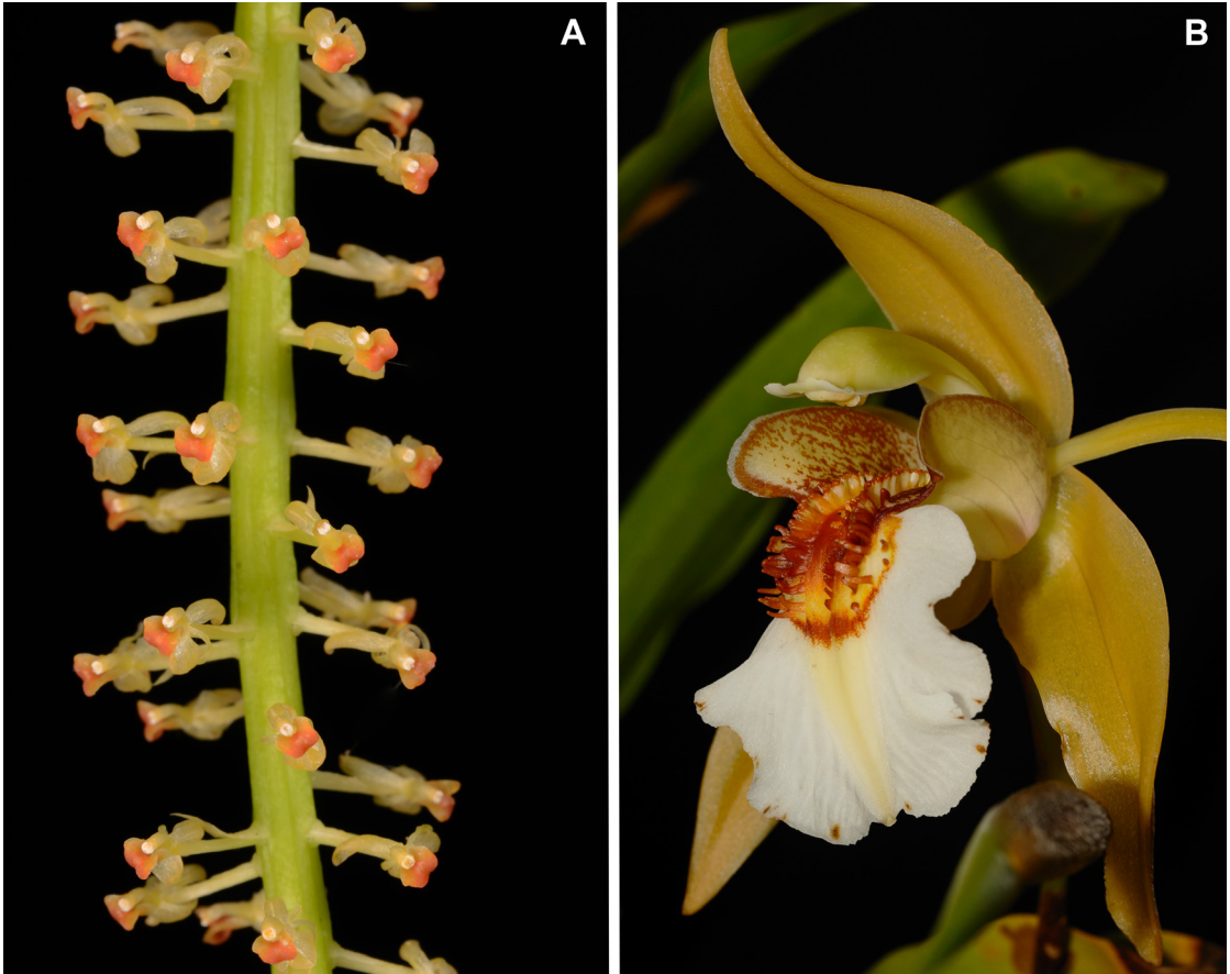
FIGURE 2. The two latest examples of new national records for Thailand revealed in Seidenfaden's living collection; both species are obvious candidates for inclusion in the next edition of the national Thai red-list. A. Liparis vestita Rchb.f. – in Thailand only known from Amphoe Rong Kwang in Phrae and from two sites in Khao Yai National Park (Nakhon Nayok, Prachin Buri). B. Coelogyne lawrenceana Rolfe – in Thailand only known through a single plant collected on Doi Inthanon (Chiang Mai) in 1978.

samples for their phylogenetic studies. However, sampling was standardized considerably in our recent project, as we decided to DNA barcode as many of the identified species as funding would allow. For this purpose, we adopted the officially recommended core-barcode for land plants, supplemented by ITS. We sampled a total of 131 species from the collection, and the prepared barcodes will be made publicly available as soon as possible.