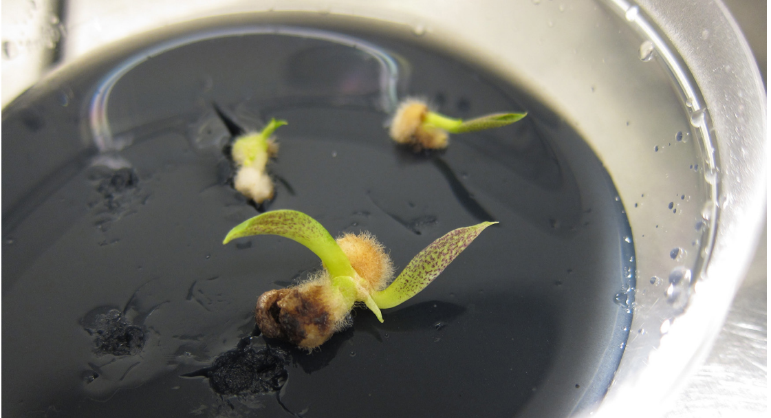
FIGURE 3. Plantlets of Sirindhornia pulchella H. A. Pedersen & Indham. grown from asymbiotically germinated seeds. This species is considered endemic to Doi Chiang Dao in the northern Thai province of Chiang Mai, and it is classified as endangered (EN) in the national Thai red-list.