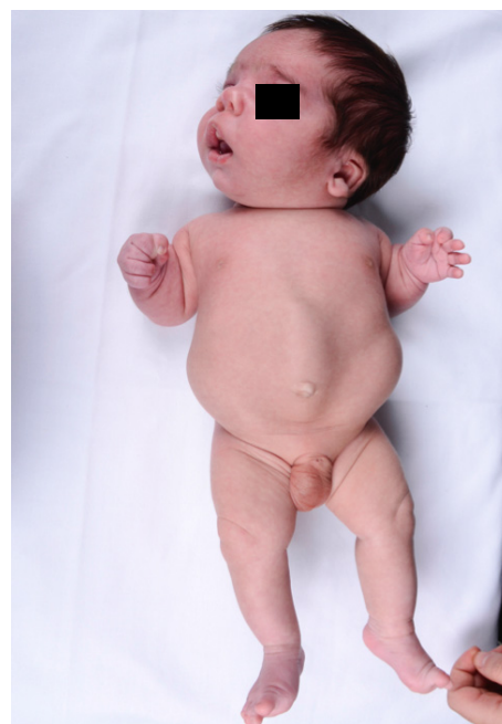
Figure 2. Photography of the male infant at the age of 7 weeks: Shortening of the upper and lower extremities including digits and toes and a micropenis with normal scrotum.

The diagnosis was genetically confirmed at the age of 4 months with the finding of a novel homozygous frameshift mutation in the ROR2 gene: c.139del p.Asp48 fs (OMIM 268310) corresponding to autosomal recessive Robinow syndrome [4].