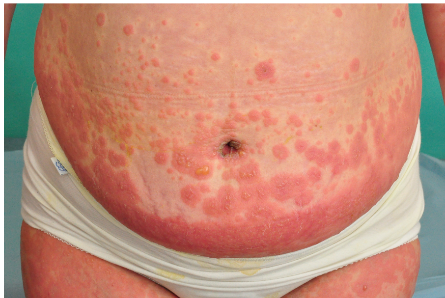
Figure 2 Umbilical involvement in pemphigoid gestationis.