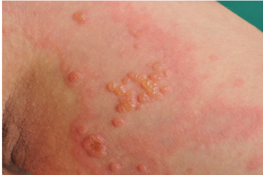
Figure 1 Blister formation in pemphigoid gestationis.

Many patients experience remission during late pregnancy, sometimes followed by a flare immediately after delivery. The flare usually settles over a period of 4 weeks without