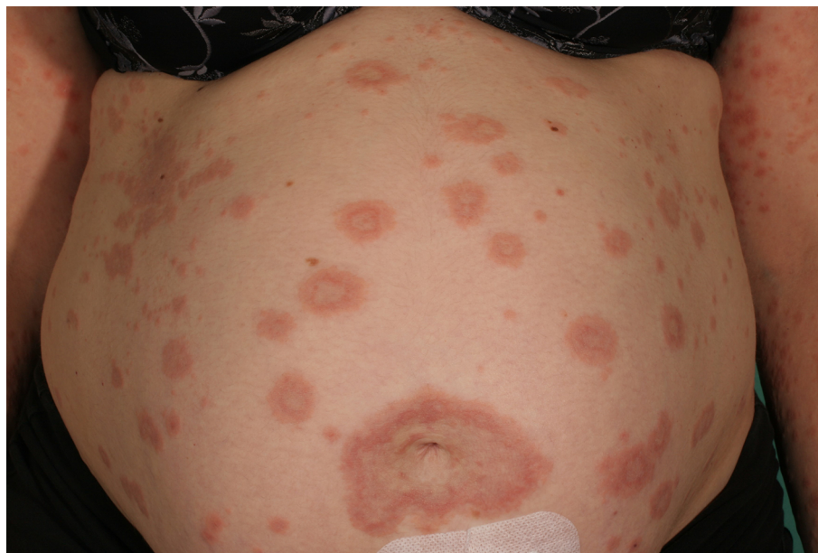
Figure 3 Erythematous, annular patches in pemphigoid gestationis.