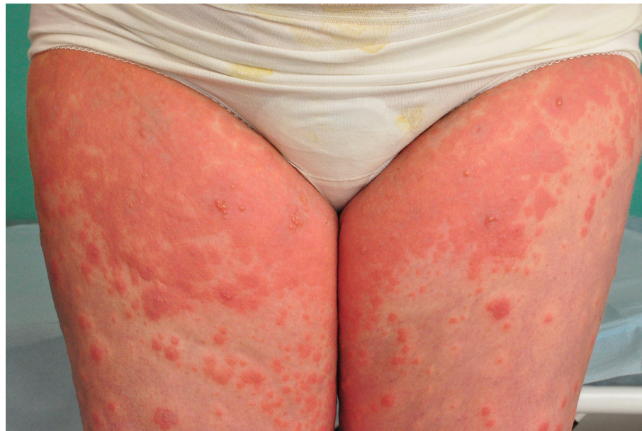
Figure 5 Urticaria-like eruption in pemphigoid gestationis.