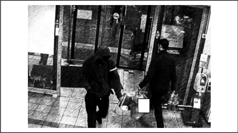
Figure 3. A robber uses the speed and stealth tactic as he enters a supermarket swiftly. He looks downward at the ground, neck and shoulders slightly bent down, holding a hammer downward in his left hand as he rushes toward the cashier (still taken from case 19).

While the Observer software seduces researchers to fragment video data into predefined categories, the construction of story lines invites researchers to come up with categories inductively, fitting to the situation as a whole. As our story lines involved more interpretative work (e.g., rather than “raising hands” descriptions were now of the type “aggressively pushing her back”), we went back and forth comparing the story lines with the video footage to increase reliability. In cases we disagreed on the interpretation, consensus was established by repeatedly watching the footage.