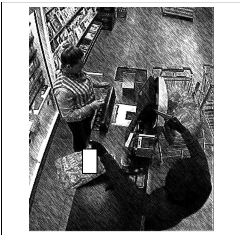
Figure 4. A robber poses a threat in an aggrandizing posture. The way the robber holds the gun, with his elbow slightly bent, extending his arm both sideways and forward, contributes to an aggrandizing posture (still taken from case 10).

stiffened, gaze averted, and hands kept in their pockets once they made contact with the victims.