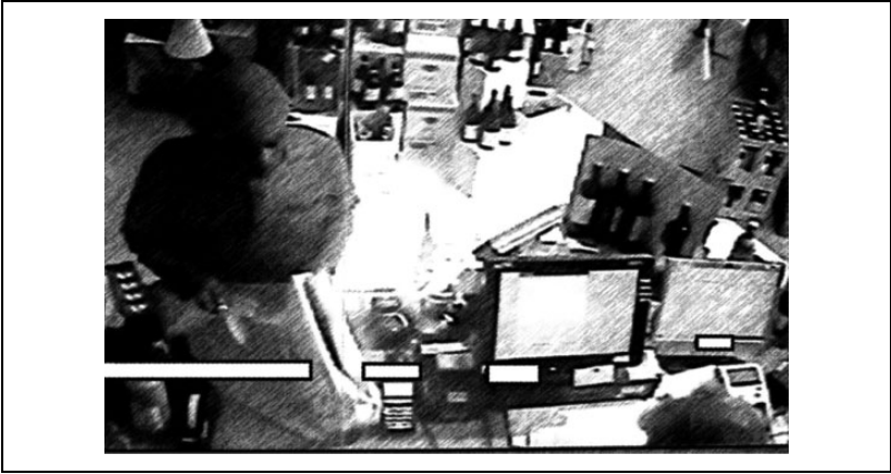
Figure 5. Typical way of holding a knife. The still shows how robbers typically use their knives, pointing at belly height as they pose their threat, which does not contribute much to aggrandizing posturing (still taken from case 25).

their intentions first seemed more likely to use knives rather than guns. To be precise, of the robbers who deployed the disguise tactic, four used knives, two guns, and one an unidentifiable object for smashing a display case. The use of knives in the disguise tactic also means that robbers need to move closer to the bodies of their victims to pose their threats.