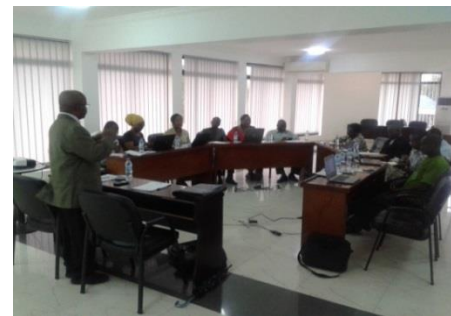
Stakeholder workshop in Dar

Participants were also appraised on the progress so far made by the project.