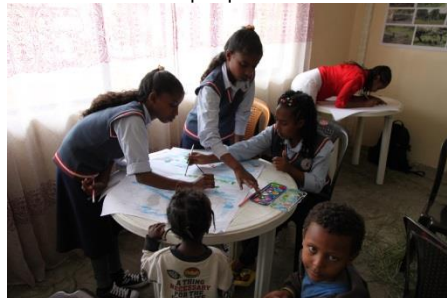
The children's drawing competition

A school children group participated in a drawing competition, to express their ideas for using green spaces and incorporating water in their local area. A women's group was also engaged in providing practical ideas based on their day-to-day life experiences. These groups are both victims of insufficient urban water services and the most frequent users of the green spaces. Their involvement is considered by the project to be vital for finding a feasible site plan that also makes sense for the local people.