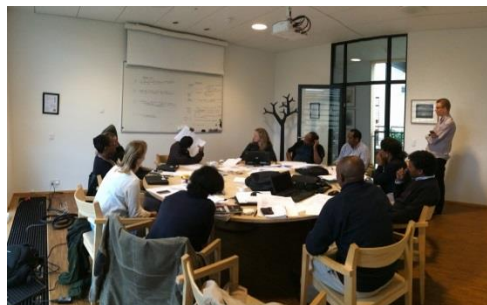
PhD workshop at IGN, University of Copenhagen

Another highlight was the 'first loop' design workshop. The PhD students from the same city worked within their city group and formulated the city challenges. Then based on the problem formulation provided by the other city, they acted as consultants to suggest concrete solutions to the other city. For example, the Addis team suggested an overall green structure vision to Dar es Salaam, supplemented with landscape-based measures such as regulating sand mining, roof top rainwater harvesting, and retention ponds at community level. The 'first loop' design workshop gave inspiration on how to transfer the existing knowledge to concrete solutions, an approach that is also applied in other project activities such as design charrettes and training workshops.