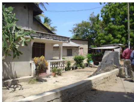
Project team talked to a local people at a borehole in Addis