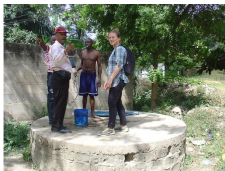
Project team talked to a local people at a borehole in Addis