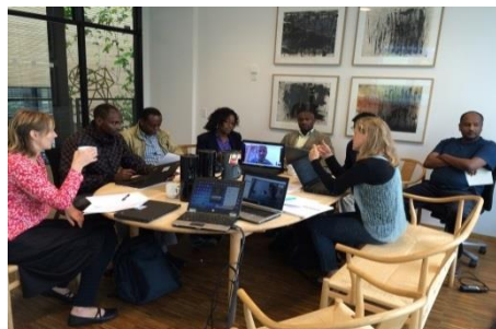
PhD workshop at IGN, University of Copenhagen

All six PhD students stayed in University of Copenhagen and were accommodated at the Danida Fellowship Center, Denmark. A series of training courses and project workshops were held for the PhD students.