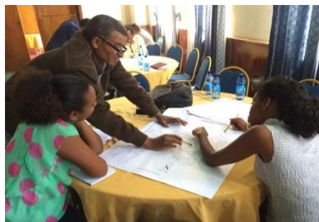
Exercise at the training workshop in Addis