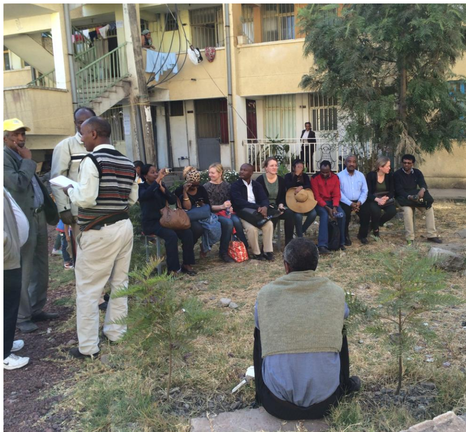
Meeting the locals at the condominium site in Addis