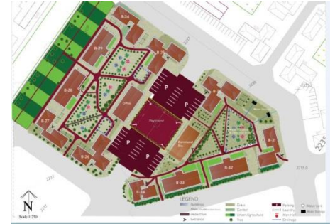
The final plan Jemo Condominium, Biruh Tesfa association

The final plan includes three major interventions: 1. Water sensitive green field to be developed on the three identified wet spots by incorporating garden benches, podiums and playfield equipment. 2. Urban agricultural field will be developed by subdividing the available open green space into 11 plots and introducing walkways for circulation. 3. Remodeling the existing main parking lots to share the excessive land for central play field of the community.