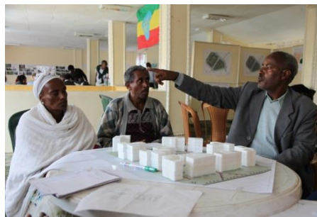
Residents discussion on potential solutions