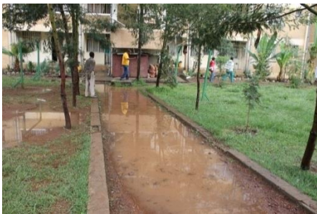
The condominium case site under flooding

Design charrettes are introduced as a research method for achieving 1:1 pilot project design solutions. It is assumed that 1:1 pilot projects with stakeholder involvement will provide stronger impact and extend further beyond the borders of the project. The first design charrette has been carried out in a condominium area at the mid-stream case site along Jemo River, Addis Ababa. Experiences gained from the first design charrette will be applied in a design charrette in Dar es Salaam.