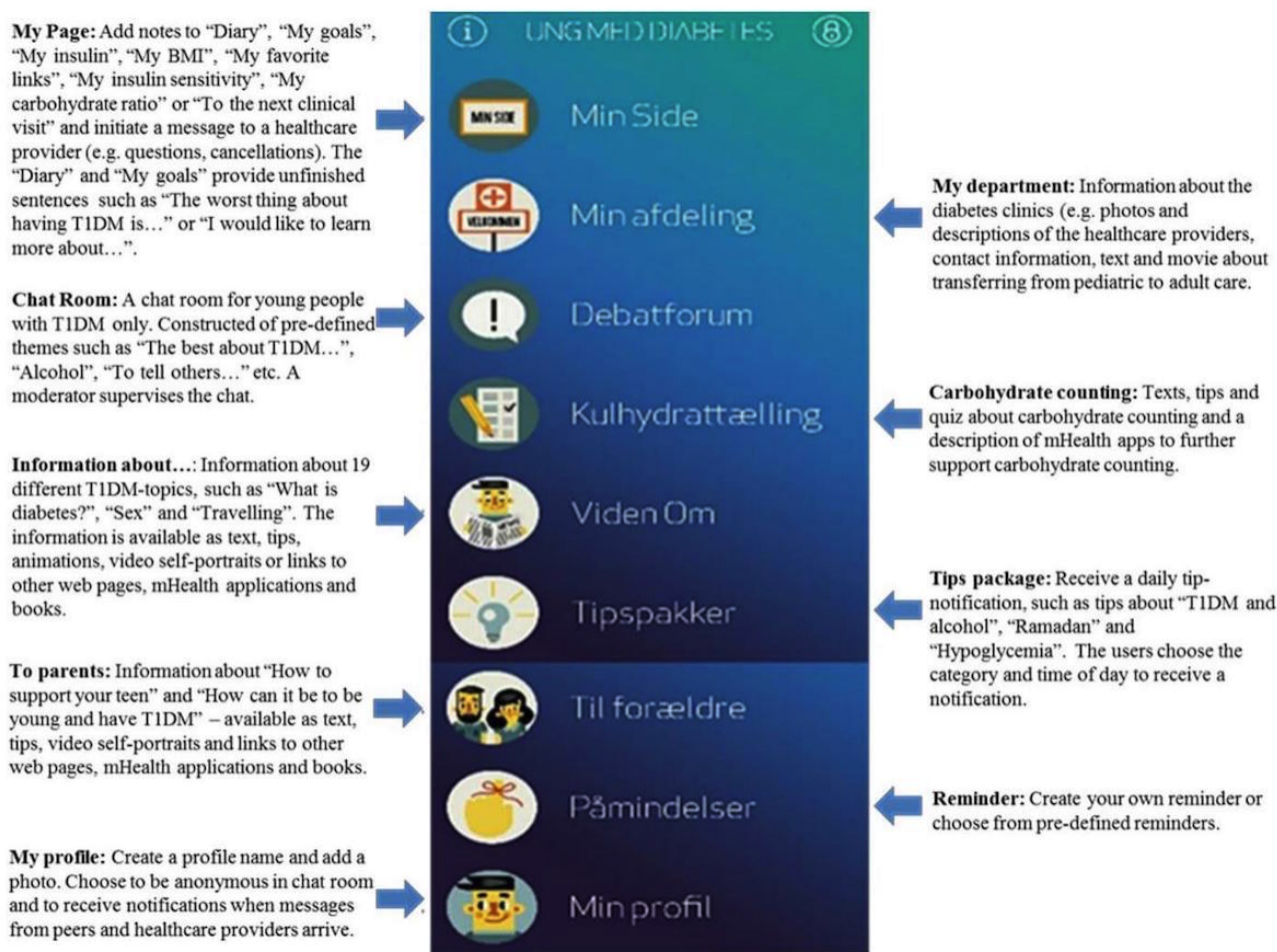
Figure 2. Young with Diabetes.

The final mHealth solution consists of the app “Young with Diabetes” (YWD) and an additional Web-based mail module through which health care providers receive messages from young people. The eight main functions in the app are outlined in Figure 2.