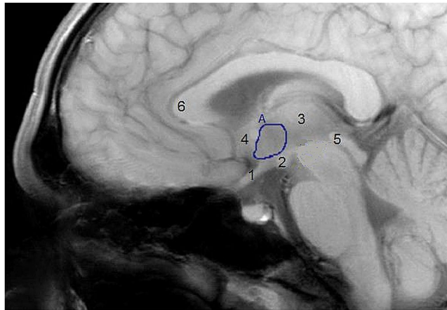
Figure 3. Segmentation of the hypothalamus region of interest (ROI). For the hypothalamus ROI (A), the optic chiasm (1), the mammillary bodies (2), the thalamus (3) the anterior commissure (4) and the top of the cerebral aqueduct (5) were used as landmarks. The reference ROI was drawn superior of the genu to the corpus callosum (6) in the grey matter.