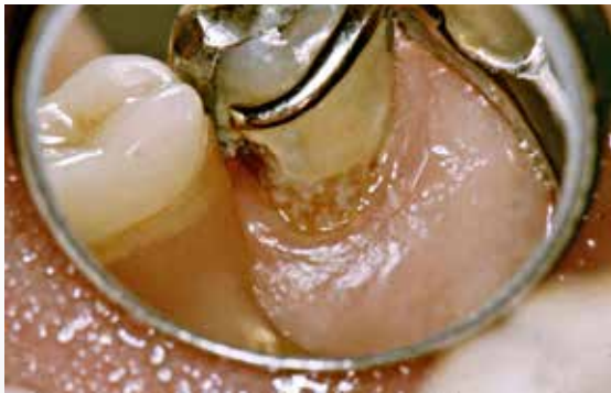
Fig. 1 The use of PRDPs is associated with increased plaque accumulation and caries risk as seen in this patient. Establishing and maintaining optimal oral hygiene through a systematic regimen of recalls and supportive therapy must be implemented.

Fig. 1 Bruken av partialproteser kan føre til økt plakkforekomst og karies risiko som vist på denne pasienten. Etablering og vedlikehold av optimal oral hygiene gjennom et systematisk regime med recalls og støttebehandling må gjennomføres.