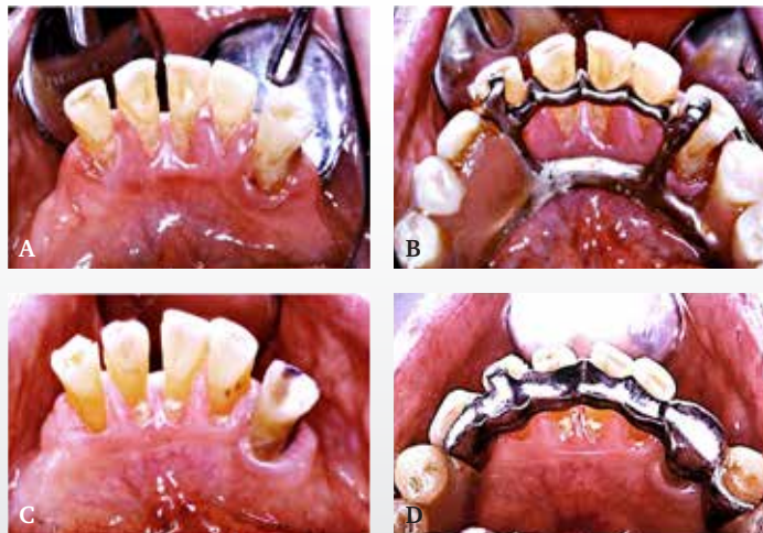
Fig. 3 A, B: Patient 76 years old. Has had maxillary CRDP and mandibular PRDP for many years. Present dentures one-year-old. Maxillary denture keeps falling down; mandibular PRDP hurts. Gingival trauma because the construction is too close to soft tissues. C, D: Patient 91 years old. Mandibular PRDP 15 years old. No gingival trauma, no relining/rebasing during these years. Denture still stable and functional until patient died aged 96.

Fig. 3 A, B: Pasient 76 år gammel. Har hatt helprotese i overkjeven og partialprotese i underkjeven i mange år. Nåværende proteser ett år gamle. Overkjeveprotesen faller stadig ned, partialprotesen gjør vondt. Gingivalt traume fordi konstruksjonen er for nær bløtvevet. C, D: Pasienten 91 år gammel. Partialprotesen i underkjeven er 15 år gammel. Intet gingivalt traume, ingen foring/rebasering i løpet av disse årene. Protesen fremdeles stabil og funksjonell til pasienten dør 96 år gammel.