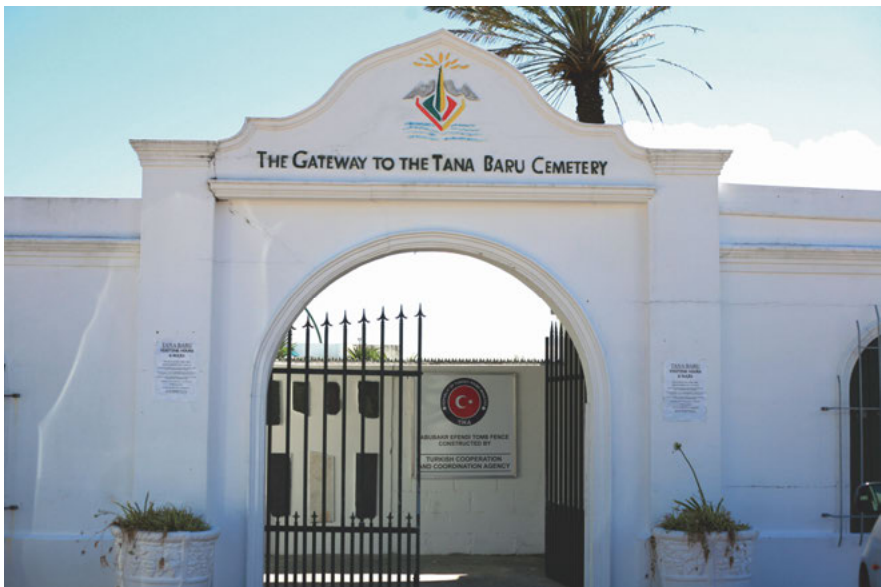
Fig. 1: The entrance gate of the Tana Baru cemetery. The funerary inscriptions studied in this note are visible on the wall behind the gate.

figure in the history of Islam (and of literacy in Arabic script) in the Cape. Sent to the Cape by the Ottoman Sultan Abdülmecid I (d. 1861) at the request of the British Queen Victoria (d. 1901) in order to settle some disputes in the Muslim community of the Cape, he was responsible for the introduction of the ḥanafī school of law in Cape Town, as well as for a reform of the Arabic-Afrikaans writing system. 15 The tomb of Abū Bakr Effendi, located in the upper section of the cemetery, has recently been renovated thanks to a project funded by the Turkish government.