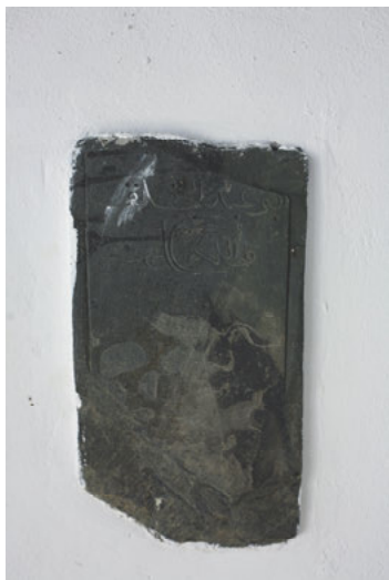
Fig. 7: Inscription 5.