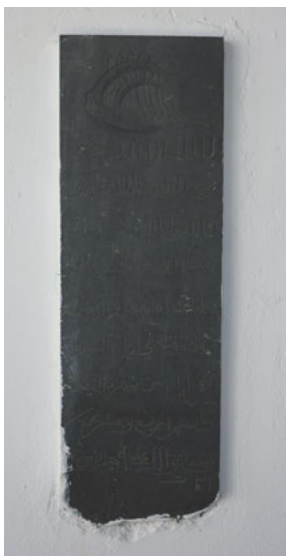
Fig. 6: Inscription 4.