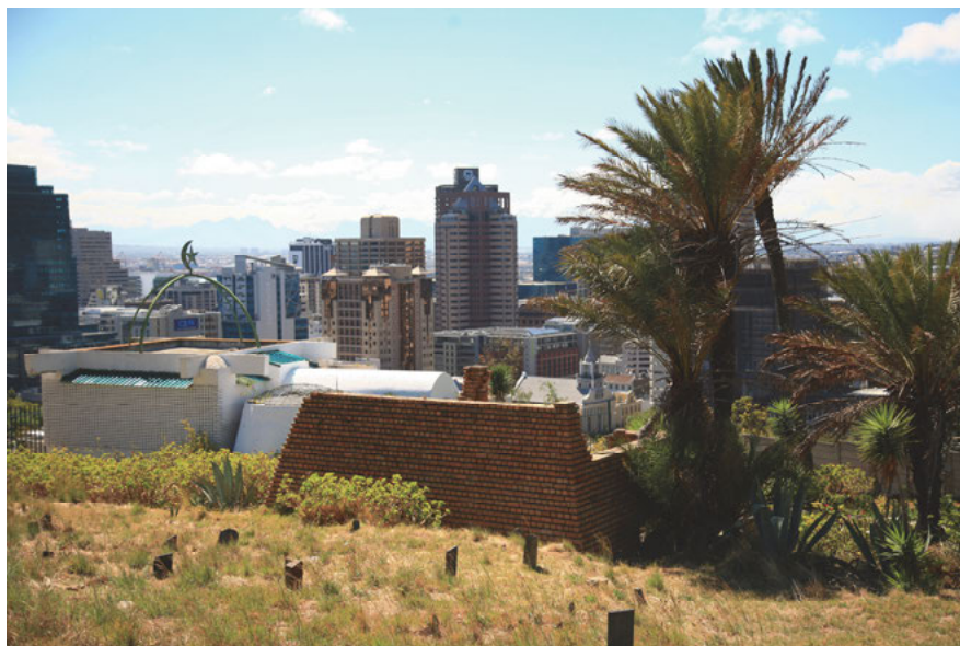
Fig. 2: The kramat -s of Tuan Guru (right) and Tuan Said Aloewie. In the background, the city of Cape Town. © Amir Golabi.