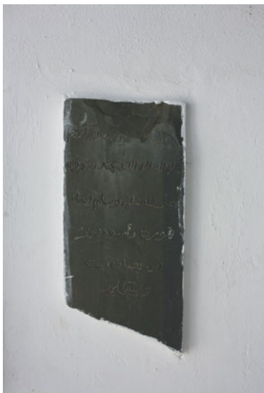
Fig. 5: Inscription 3.