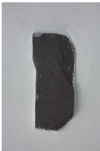
Fig. 4: Inscription 2.