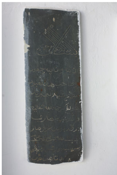
Fig. 3: Inscription 1.