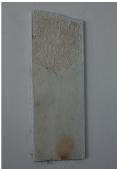
Fig. 8: Inscription 6.