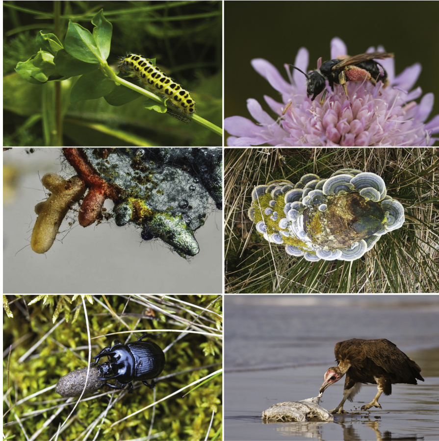
Fig. 3. Examples of biotic expansion by various carbon sources: Upper left: Plants as food source for herbivores, the specialist moth Zygaena filipendulae (Linnaeus, 1758) feeding on Lotus corniculatus (Linnaeus, 1758). Upper right: Flowers as a pollen and nectar source for the oligolectic solitary bee Andrena hattorfiana (Fabricius, 1775), feeding exclusively on Knautia arvensis (L.) Coult flowers. Middle left: Biotrophic interactions by three different fungus species forming ectomycorrhizae with roots of a deciduous tree. Middle right: The stump of a beaver-cut birch as habitat for the bracket fungus Trametes versicolor (Lloyd, 1921). Lower left: Dung as food source for the dung beetle Typhaeus typhoeus (Linnaeus, 1758). Lower right: Carcasses as food source for a vulture, Necrosyrtes monachus (Temminck, 1823). Photo credits: Rasmus Ejrnæs ( Zygaena ), Jens H. Petersen (mycorrhiza), Thomas Borup Svendsen ( Trametes ), Morten DD Hansen ( Andrena ), Typhaeus), Rune Sjø Neergaard ( Necrosyrtes ).

feedback relation to the buildup of the regional species pool (Bruun & Ejrnæs 2006), indicating a possible non-random link between position and species pool. Change in ecospace position can be caused by natural disturbances or succession as well as land-use change. Ecospace position may also feedback on processes, e.g. some positions are more likely to attract grazing or uprooting mammals (e.g. Bailey et al. 1996), some are more prone to wildfires (Cardille, Ventura, & Turner 2001), some intensify asymmetric resource competition between plants (Schwinning & Weiner 1998) and some may induce certain trophic interactions (Chase 1996). However, most natural processes are entirely or partly decoupled from the abiotic part of ecospace. For example coastal erosion, herbivory, trampling, defecation, flooding and strong winds may all take place across a wide range of different biotopes.