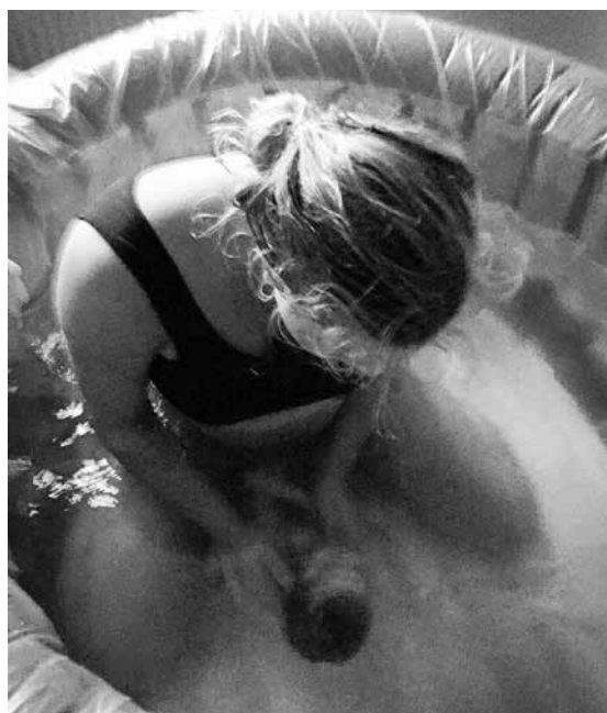
Home birth in water.

This study has a descriptive objective as it presents and evaluates neonatal outcomes in home births, but