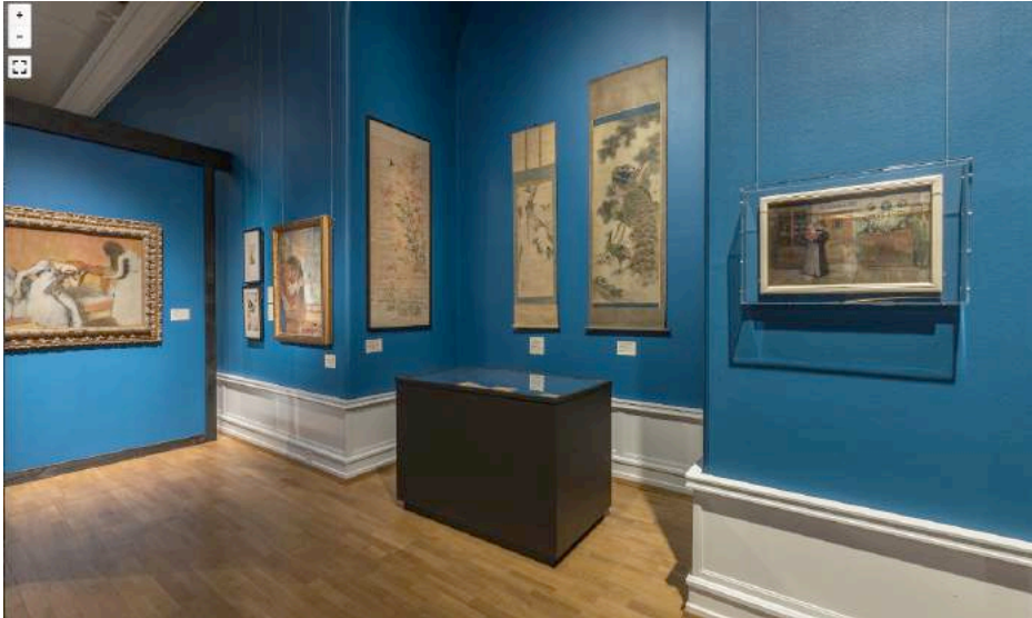
Image 1: View of Japanomania exhibition at the National Gallery, Oslo. Screenshot from 360 degree view of the exhibition at the museum website: "Japanomania in the North 1875-1918", accessed October 30, 2016,

http://www.nasjonalmuseet.no/en/exhibitions_and_events/exhibitions/national_gallery/Japanomania+in+the+North+1875-1918.b7C_wtjKXP.ips .