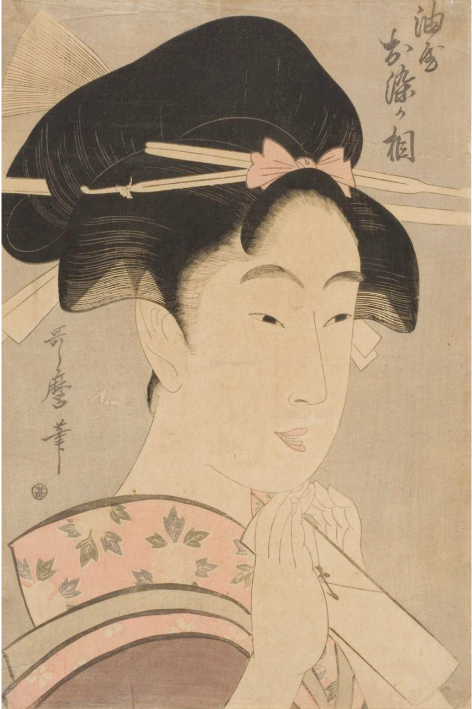
Plate 4: Kitagawa Utamaro, Oiran Osama of Abura House , undated, woodcut, 38,3 cm x 25,6 cm. Ateneum Art Museum, Helsinki. From the National Gallery press material.