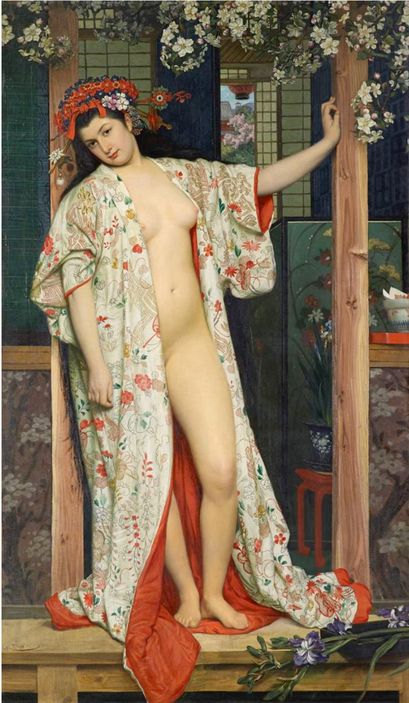
Plate 3: James Tissot, Japanese Woman Bathing , 1864, oil on canvas, 208 cm x 124 cm. Musée des Beaux-Arts de Dijon.