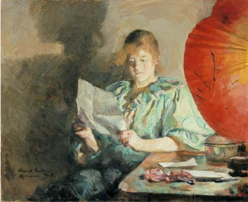
Plate 5: Harriet Backer, Evening, Interior , 1890, oil on canvas, 54 cm x 66 cm. Bequest of Lalla F. Hansen, The National Museum, Oslo.