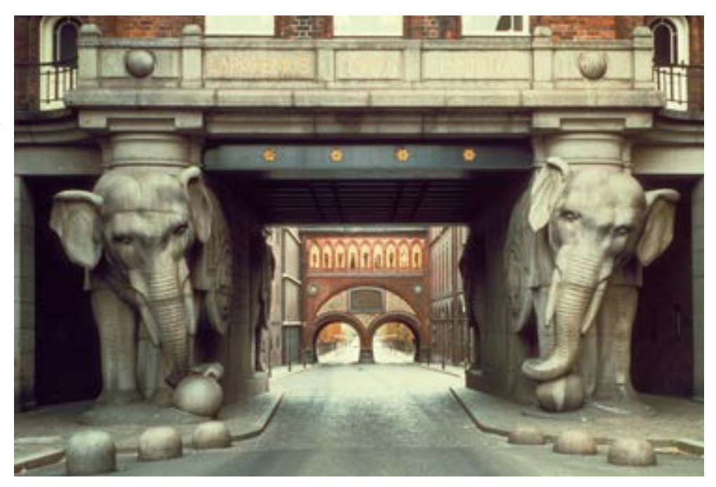
Fig. 1 Traditional heritage conservation is often occupied with preserving selected objects that experts consider the best or most representative buildings of a type or period. The Elephant's gate, built as an adorned water tower in 1901 by the famous architect Wilhelm Dahlerup, it is one of the structures at the former Carlsberg breweries that is listed.

In many European regions, industrial production facilities change due to socio-political and economic processes. Some of the abandoned industrial sites are converted into new urban districts, forcing the involved stakeholders to mediate between the traces of industrial past on site and its desired future state. Such transformation involves a lot of political, economical, ecological and functional considerations and also cultural questions, which I will focus on here, concerning how we value the existing traces from the industrial period in new contexts. Although every urban redevelopment