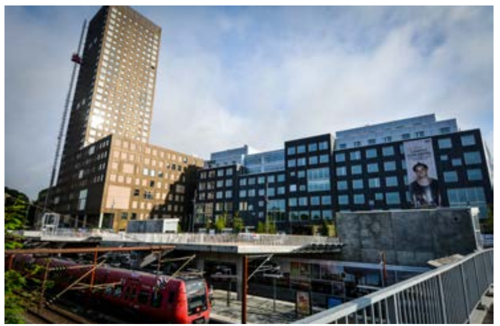
Fig. 8 Carlsberg's largest new-built complex is a quite generic structure. It does not adopt significantly to the industrial architecture nor the activities of the people that had used Carlsberg after the financial crisis.

new learnings and new perspectives underway. Acknowledging that it is possible to discover new possibilities for reuse and to formulate new heritage values along the way, stakeholders have to find alternatives to the established procedures for planning and heritage making.