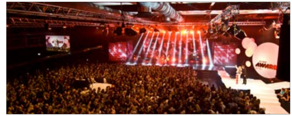
Fig. 4 Concert in one of Carlsberg's bottling plants. Not considered worthy of keeping during the planning and heritage assessments of the new Carlsberg district, Tap 1 became a popular concept venue that drew new people to the formerly closed-off production area. It has been scheduled for demolition during the entire planning process.

Now, as construction has recommenced and the temporary tenants have been given notice, they have been offered accommodation in the new buildings being built. But although the price difference is not always remarkable, they decline the offer because they came precisely because of the raw industrial atmosphere and would now rather move on. <sup>22</sup> It should not be a surprise that first movers follow the pioneering spirit by moving on to new emerging urban areas. We ought, however, to consider why there is such a great discrepancy between the official plan and conservation strategy for Carlsberg and the enthusiasm that has characterised the reuse of Carlsberg's newer industrial and distribution halls in recent years.