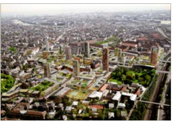
Fig. 2 (left and right) The Carlsberg breweries in the city of Copenhagen. Aerial photo prior to the redevelopment project begun in 2006 (left) and visualization of the new district as imagined in 2009 (right). The idea was to turn the production site into a dense and "vivid city district"

floor space to accommodate the mix of housing, businesses and cultural institutions.