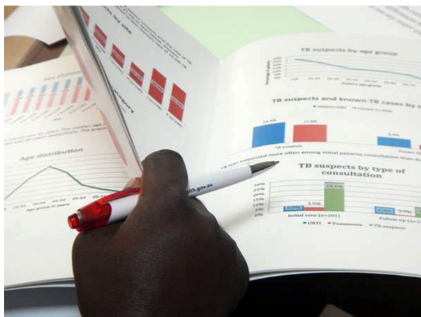
Fig. 1. Feedback report.

Based on the results of the first audit, performance feedback was developed for each of the healthcare providers. This included a feedback report where the results from the first audit were summarized in words, tables, and diagrams focusing on the healthcare providers' overall practice for suspecting tuberculosis and referral of tuberculosis suspects for further investigations (Fig. 1). Moreover, a personal feedback sheet was developed for each participant to enable the individual participant to compare their own results with those of their peers. The feedback report and personal feedback