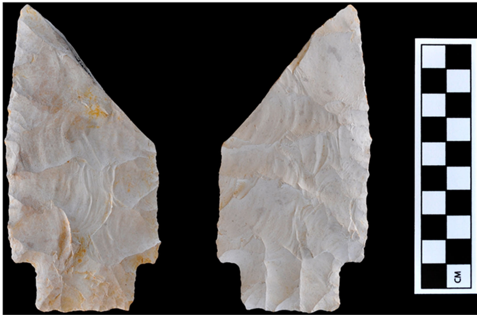
Figure 1 The Ladyville Wide Stemmed (JuaD/98/12/1) biface fragment.

thinning flakes are better defined on one face. The diagonal (perverse) fracture across the blade section of the point is suspected to be the result of a manufacturing error (Crabtree 1972, 82–83; Whittaker 1994, figure 8.33). As such, this point may not represent a completely finished specimen, but it was likely close to completion based on the ratio of blade width to thickness (6.6:1), which falls within Callahan's (1979, table 5) stage 5+ range for experimental replicas of fluted bifaces, as well as the basal end-thinning/channeling of the stem and some edge retouch (Callahan 1979, figure 67e, f). The lack of grinding of the stem edges or base lends further credence to the suggestion that this biface was unfinished.