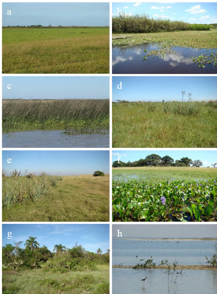
Figure 3. Major habitat features of the Reserva Biológica do Mato Grande, Brazil. (a) Open grassy marsh at the transition with sandy grassland over ancient beach ridge. (b) Sarandi bushes and tall emergent herbaceous plants such as Zizaniopsis sp. (right) cover most of the central sector of the reserve. (c) Stands of Schoenoplectus californicus are also common in marshes. (d) Panicum prionitis tussocks and the spiny Eryngium pandanifolium dominate the upper stratum of seasonally flooded grasslands along the Canal São Gonçalo. (e) An E. pandanifolium (left) patch marking the transition between wetlands and dryer grasslands in higher ground (right) along the northeastern limit of the reserve. (f) Floating aquatic macrophytes in open marsh with restinga forest over beach ridge in the background; large trees are Ficus sp. and Erythrina crista-galli . (g) Syagrus romanzoffiana palms in restinga forest over sandy beach ridge. (h) Muddy and sandy beaches with small sarandi bushes along the Lagoa Mirim.

Between July 2007 and March 2009 we carried out 21 monthly expeditions to the study area. An additional expedition was carried out on 23 October 2014. Expeditions lasted 1–2 days each (10–34 h of sampling effort), totaling 341 hours of fieldwork. We surveyed two sectors of the RBMG (Figure 2). The western part of the reserve was visited on 13 occasions. We searched for birds mainly along an 8.5 km transect, from rice lands bordering the reserve to the restinga forest and sandy/muddy beaches of the Lagoa Mirim. The eastern part of the reserve was visited nine times. We surveyed birds mostly along a