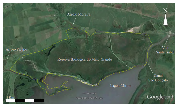
Figure 2. Limits (yellow) of the Reserva Biológica do Mato Grande, Brazil. The white lines indicate bird sampling transects in the eastern (right) and western (left) sectors of the reserve.

Here, we aimed to list bird species occurring in the Reserva Biológica do Mato Grande and surroundings. We surveyed birds in the field and searched for additional records in museums and virtual repositories of voice recordings and photographs. We followed guidelines to adequately list and document species in avian inventories (Bencke et al. 2010; Lees et al. 2014). We also provide data of abundance for species of conservation concern and for species congregating in roosts within the reserve. Based on our findings, we discuss the importance of this protected area for the conservation of endangered, endemic and/or wetland birds in the region.