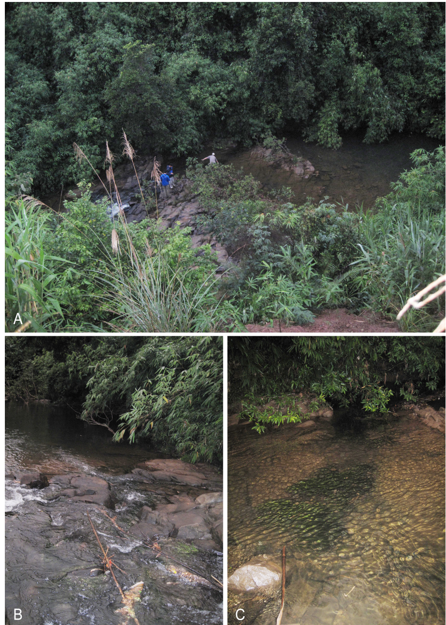
Fig. 1. Cryptocoryne crispatula var. tonkinensis – A: habitat showing stream running in granite bedrock in gully; B: descent to water shown in A; C: pool with large patch of submerged plants. – Vietnam, Quang Ninh Province, W of Hai Ha, Cau Khe Heo, 130 m, 15 Dec 2013, photographs by M. Ørgaard.

Several people have dealt with the identity of var. tonkinensis over the years. Mühlberg & Hertel (2007) dealt with all the classical collections from Vietnam in a detailed morphological, phenological and nomenclatural study.