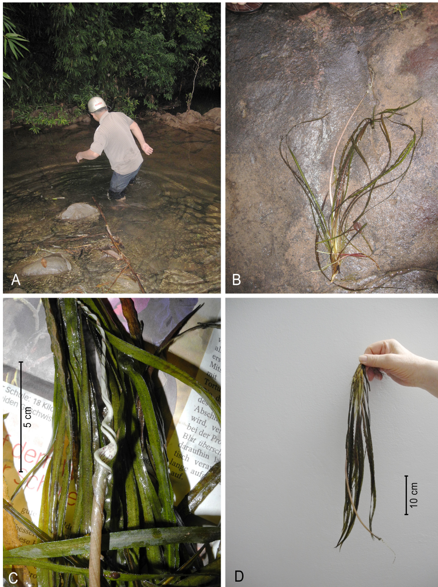
Fig. 2. Cryptocoryne crispatula var. tonkinensis – A: pool shown in Fig. 1C with large patch of submerged plants being sampled; B: extracted plant lying beside pool; C: spathe showing spirally coiled limb with purple line-like markings; D: sampled plant showing long flaccid leaves and long spathe exceeding leaves in length. – Photographed on 15 Dec 2013 by M. Ørgaard.

The original description of Cryptocoryne tonkinensis by Gagnepain (1941) is based on three herbarium gatherings from Vietnam: “Rive droite de la rivière Noire, en aval de Ben-heu”, 29 Nov 1887, Balansa 2043 (L0041882, L0041883, P00461144, P00461145, P00461146, P00461147); “Vallée de Baa-tai, à la base du Mont Bavi” [present-day Mt Ba Vi], 8 Feb 1887, Balansa 2044 (L0041884, L0041885, P00461140, P00461141, P00461142, P00461143); and “Vallée de Baa-tai (Mont-Bavi)”, Aug 1887, Balansa 2045 (P00509483). The specimens in L can be seen at http://vstbol.leidenuniv.nl/NHN/Explore and those in P can be seen at https://science.mnhn.fr/institution/mnhn/collection/p/item/search/form .