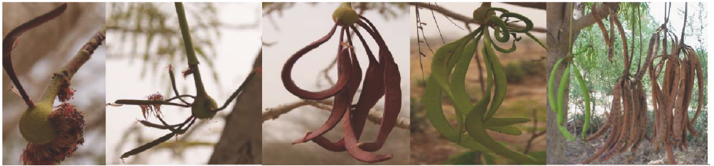
Fig.5. Capitulum fruiting phases of Parkia biglobosa (fruiting start to end).