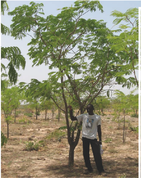
Fig.1 a general view of the provenances trials at Gonsé at age 13.

Substantial genetic differentiation was observed among the natural populations of P. biglobosa in West Africa for most of the growth traits and survival. The significant differences among populations found in survival and in vigour (fig.2.) could partly be described by geographic and ecological clines supporting the hypothesis that the gene pool of P. biglobosa in West Africa is differentiated according to climate conditions. This has important implications for gene conservation, seed procurement and design of domestication programmes as discussed in paper IV below.