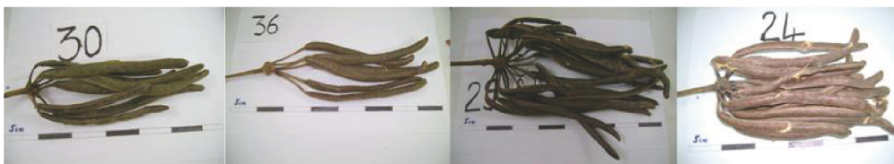
Fig.7. variation in pod number and morphology observed within selected trees

Significant correlation were found between the fruit traits and regression analysis confirmed that indirect selection for seed high yielding trees could done based on the pod morphological traits (fig.7).