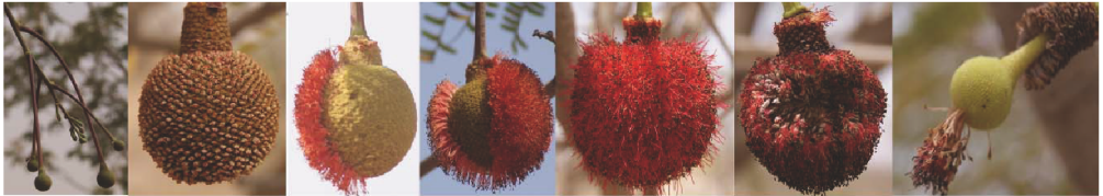
Fig.4. Capitulum flowering phases of Parkia biglobosa (start of flowering to flowering end)

These variations observed in phenological traits suggest that attention has to be paid by breeders and silviculturalists in the choice of the provenances when establishing seed orchards and plantations of P. biglobosa in order to chose provenances which could interpollinate.