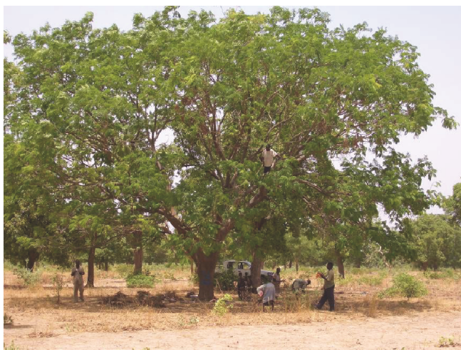
Fig.6. fruit collection and tree characteristic measurement in Parkia biglobosa natural stands in a parkland.