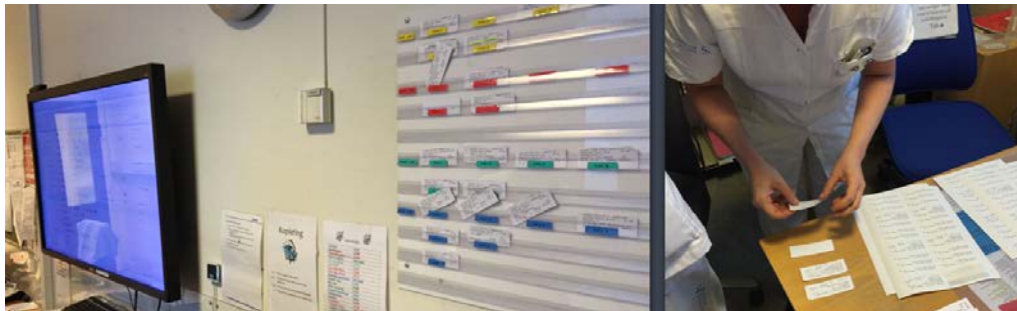
Figure 2. eWB (left), manual board (middle), arranging printed labels for the manual board (right).

being ready for transfer to the operating room (OR). It is, however, complicated to establish new eWB-mediated ways of interdepartmental coordination. The hospital departments are traditionally quite autonomous, each having their own culture and procedures, and there is little incentive to use the eWB in a manner that would benefit other departments (Lassen and Simonsen, 2014).