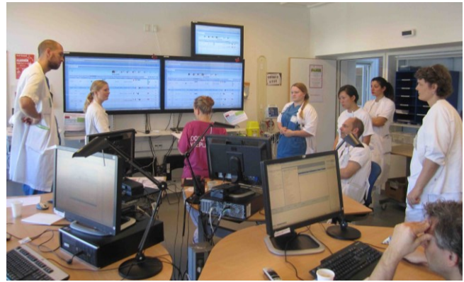
Figure 2: Timeout in front of the whiteboard.

pret test results and for senior physicians to provide advice on additional possibilities to consider. We also observed how the chief physician delegated relevant tasks to the junior physicians, and the more experienced physicians offered them advice on how to perform these tasks.