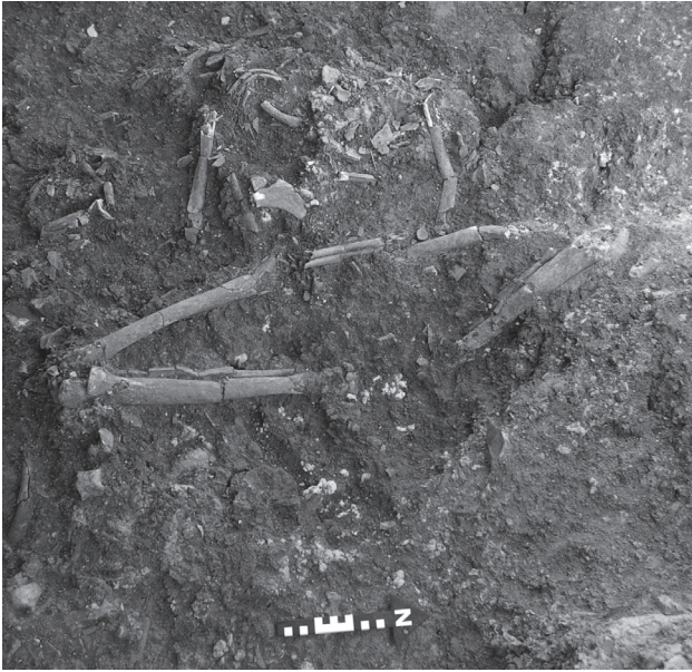
Figure 3. The sitting burial of an adult male from Ayn Qasiyyah, dated to c. 20,400–19,800 cal BP.

(Maher 2007, Muheisen 1988), represent some of the oldest human remains yet found in Jordan. The burial position was unusual: the legs were spread apart and the torso was collapsed into itself, with the skull positioned on the chest at an unusual angle. Given the character of the sediment and the position of the various skeletal elements we suggested that the remains of this older male were probably bound or contained in some kind of cloth, before they were placed sitting upright into the permeable and wet marsh in which they sunk and were gradually buried (Richter et al. 2010b). This burial practice can be considered akin to excarnation treatments of the dead, where the deceased are placed in significant places and left to decay without burial. The Ayn Qasiyyah burial may suggest that these practices were more widespread during the early Epipalaeolithic than previously assumed, which would explain the relative lack of human remains during this period.