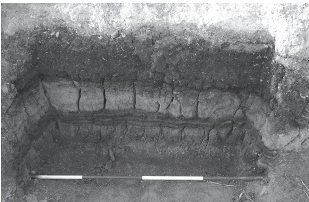
Figure 2. Ayn Qasiyyah sedimentary profile showing the dark palaeommarsh deposit that contains the early Epipalaeolithic site

Excavations of the early Epipalaeolithic sequence focused on three areas (A, B and D). The stratigraphy of all three