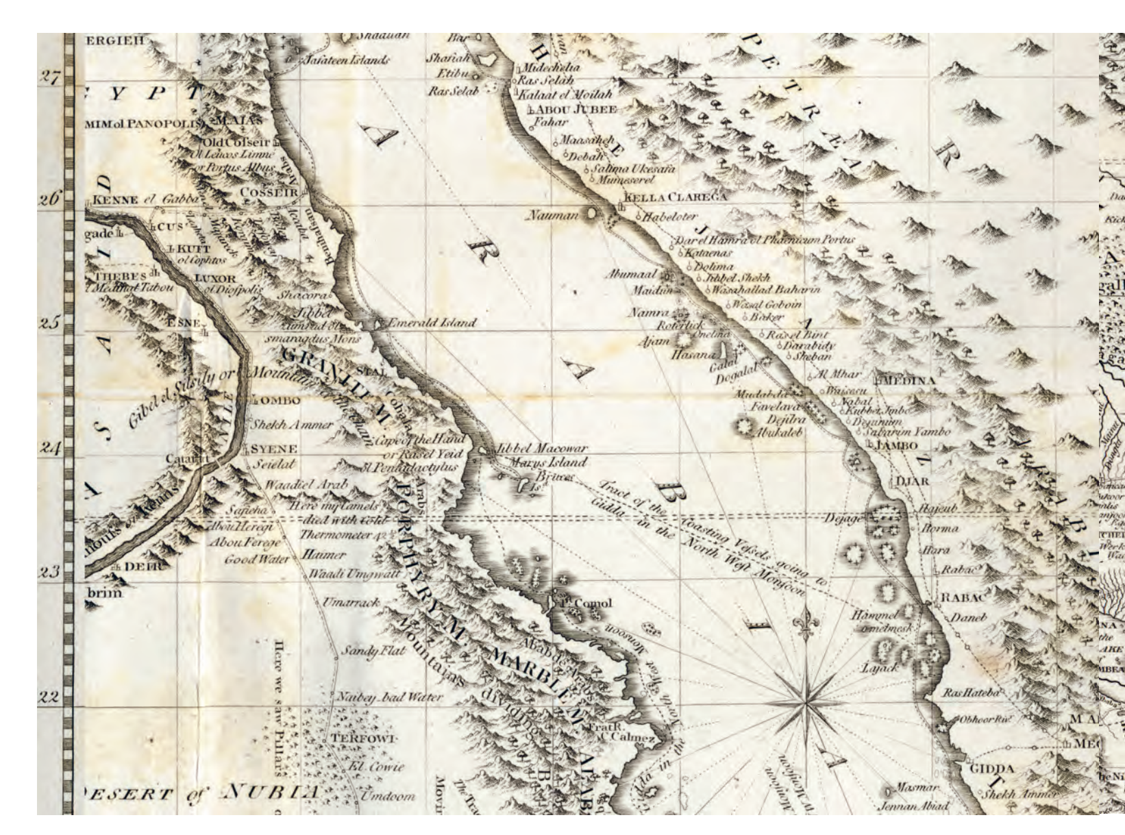
Fig. 1. Part of Bruce's map of the Red Sea, Egypt, Nubia and Abyssinia, published with all three editions of his Travels and showing the area on both sides of the Red Sea south of Qusayr ["Cosseir" on the map]. Reproduced from a copy of Bruce's map in the author's possession.

called "Eve's grave" is not two days' journey to the east of Jeddah (p. 554), but hardly two miles to the northeast of the city (my Reisebeschreibung , first volume, p 258).<sup>43</sup>