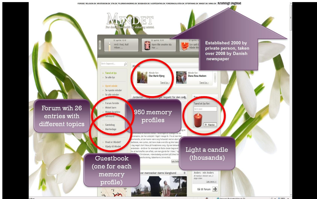
Figure 1: Screenshot of Mindet.dk's entry with our explanations

Mindet.dk seems to fill a void for having marked or designated places for mourning and bereavement (after the funeral and in addition to the graveyard), not the least in the case with the loss of infants or with stillborns: deaths which more than others leave the bereaved asking “why” and a lengthy process of mourning and reworking the meaning of life. The quality of an online community (Baym 2010) is evident in this respect; this is where users with the same experiences can meet.