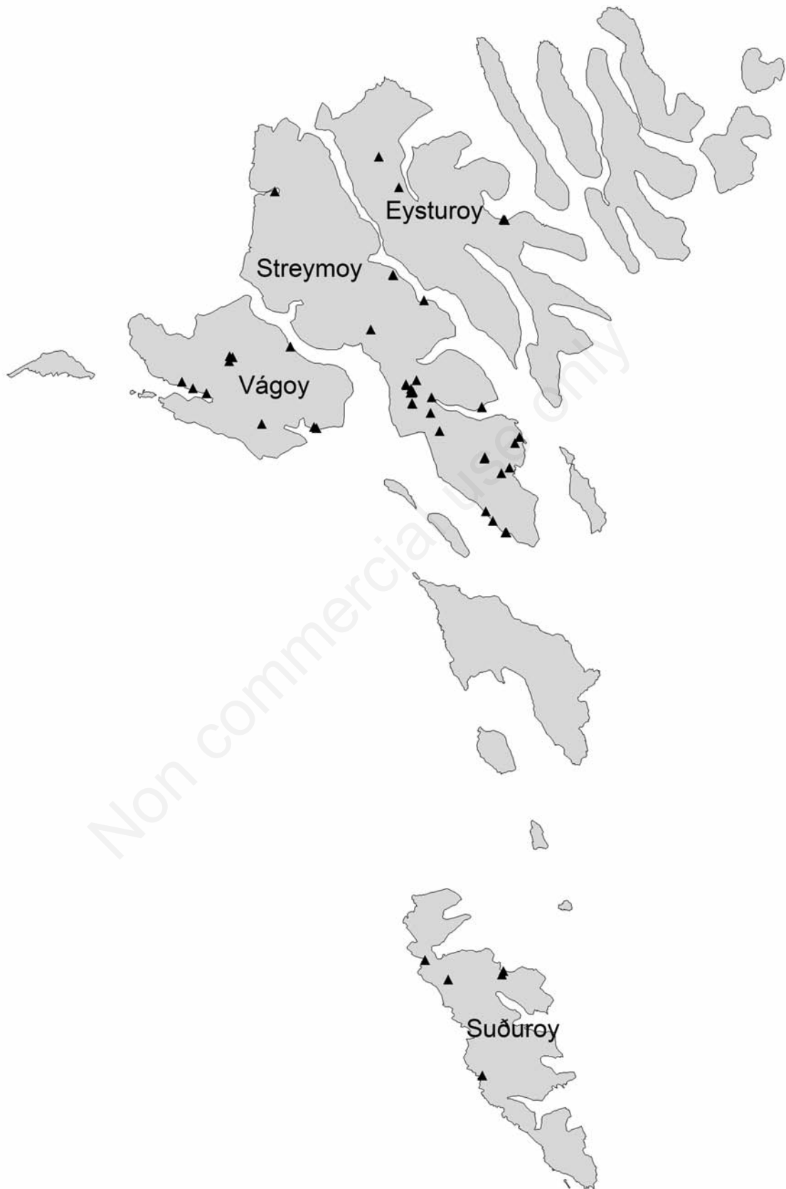
Fig. 1. Faroe islands. Overview of sampling stations (black triangles).