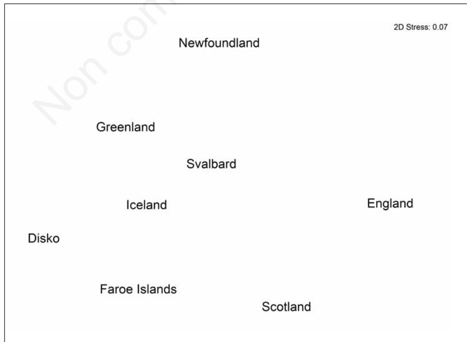
Fig. 4. Non-metric multi dimensional scaling plot of the similarities in tardigrade species/subspecies composition between selected countries/islands. Stress is 0.07.

C. ornatus was not found again in this study. However this variety is not valid as a subspecies according to Guidetti and Bertolani (2005). The two species M. dubius and D. macronyx are stated as species inquirendae (Ramazzotti and Maucci, 1983; Guidetti and Bertolani, 2005) and are therefore not considered as valid species. According to Ramazzotti and Maucci (1983), D. macronyx and D. dispar could be synonyms, and the smooth eggs reportedly laid in the exuvia of D. macronyx could instead belong to coexisting tardigrade species. However, as previously mentioned we can not state with certainty that Tuxen's species belongs to Dactylobiotus . Sellnick (1908) found some specimens belonging to the genus Echiniscus but did not assign them to species. He added a figure and described the specimens as having five lateral hairs ( i.e. cirrus A, B, C, D, and E), two spines dorsally on paired plate II, one on each side, although in one specimen there was only one spine present. The plates were granular, 4 th legs with a dentate collar, 4 claws on each leg and the two middle claws with a basal spur. On the basis of this description one is led to think that these specimens could be either E. merokensis suecicus or E. quadrispinosus cribrosus . Both E. merokensis suecicus and E. quadrispinosus , but not the subspecies cribrosus , have been found again on the Faroe islands in this study. It is likely to think that these also were present back in the early 1900s, but Sell-