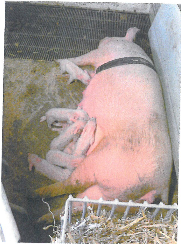
The FF pen. Around the sow's waist is a pulsemeter attached as part of a trial.