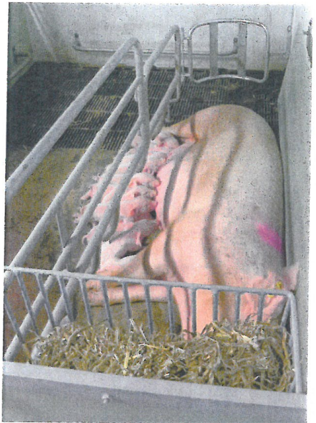
The SWAP pen.

2 HERD – Centre for Herd-oriented Education, Research and Development, Department of Large Animal Sciences, University of Copenhagen, Frederiksberg, Denmark