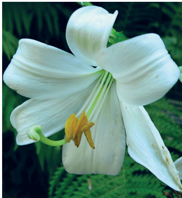
Fig. 4. Lilium candidum (family Liliaceae). Photo taken July, 2005, at VanDusen Botanical Garden by Stan Shebs; reproduced via Wikimedia Common.

it supersedes that of the lilies....” 22 The names shōshan and shōshannā are also found in Aramaic in the forms shūshantā and shōshantā . 23