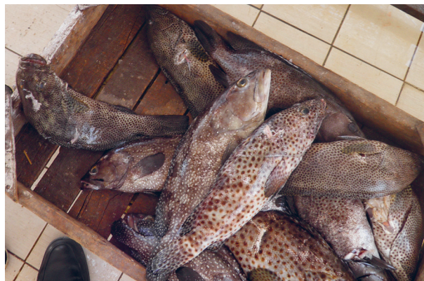
Fig. 6. Several species of Coral Groupers (family Serranidae) for sale at the fish market in the Egyptian town of Hurghada on the Red Sea Coast. Forsskål must have collected specimens and vernacular names for fish from local fishermen and at fish markets at the Red Sea.

b. Regarding fish names, the big Coral Grouper ( Plectropomus pessuliferus ), often called the Roving Grouper, or the Roving Coral Grouper, is called nājil at many places along the Red Sea. This name was noted by Forsskål and confirmed to me during my investigations in Hurghada in May 2011. 28 Nevertheless, in Sinai this name was used by the Bedouins of the Muzīn tribe for the Lyretail Grouper ( Variola louti ). 29 As the Lyretail Grouper is the only grouper in this region which has a lunate caudal fin, 30 it is unlikely that the species were mistaken for the Roving Grouper, especially as my informant was a fisherman. We have thus here apparently an instance where a name may shift from one species to another. It must be noted, that both species are large carnivorous fish, that are closely related