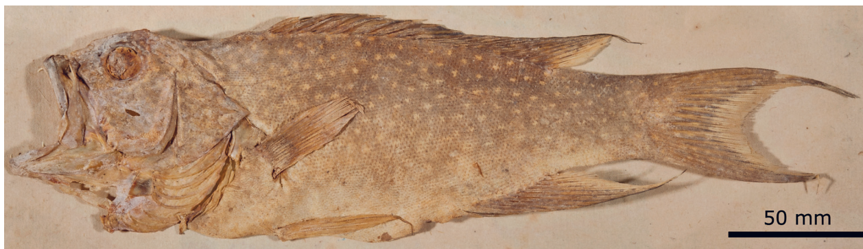
Fig. 8. Type of Variola louti (Forsskål, 1775) (family Serranidae; original name: Perca louti Forsskål) at the Natural History Museum of Denmark, ZMUC, no. P43566 in Forsskål's "Fish Herbarium." It was collected by Forsskål at Jidda in Saudi Arabia or Luhaiya in Yemen and described in Descriptiones Animalium , pp. XI and 40, no. 40.

fish market. 31 According to the informants, they unanimously told that kushar is a group name including five different species. In Sinai it was a name used for both the groupers, the Coral Hind ( Cephalopholis miniata ) and the Peacock Grouper ( Cephalopholis argus ). Forsskål mentions this name as the species name for the Brown Marbled Grouper ( Epinephelus fuscoguttatus ), and he writes that this name is from Jiddah ( Djiddæ ). 32 In Suez this species is called kassjara , following Forsskål's own notation. 33 Forsskål thus clearly thinks that this common denomination is a species name. However, it is a common name for a range of different species of groupers in Jiddah, 34 and thus Forsskål has thus apparently misunderstood the real meaning of the name.