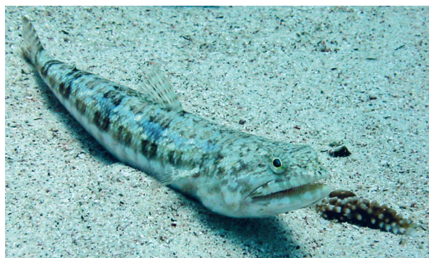
Fig. 2. Synodus variegatus (Grinners; family Aulopiformes). Photo taken April, 2007, in the Red Sea at Dahab, Egypt, by Alan Slater; reproduced via Wikimedia Common.

c. The fish species Variegated Lizardfish ( Synodus variegatus ) 15 has the Arabic name hāriṭ in southern