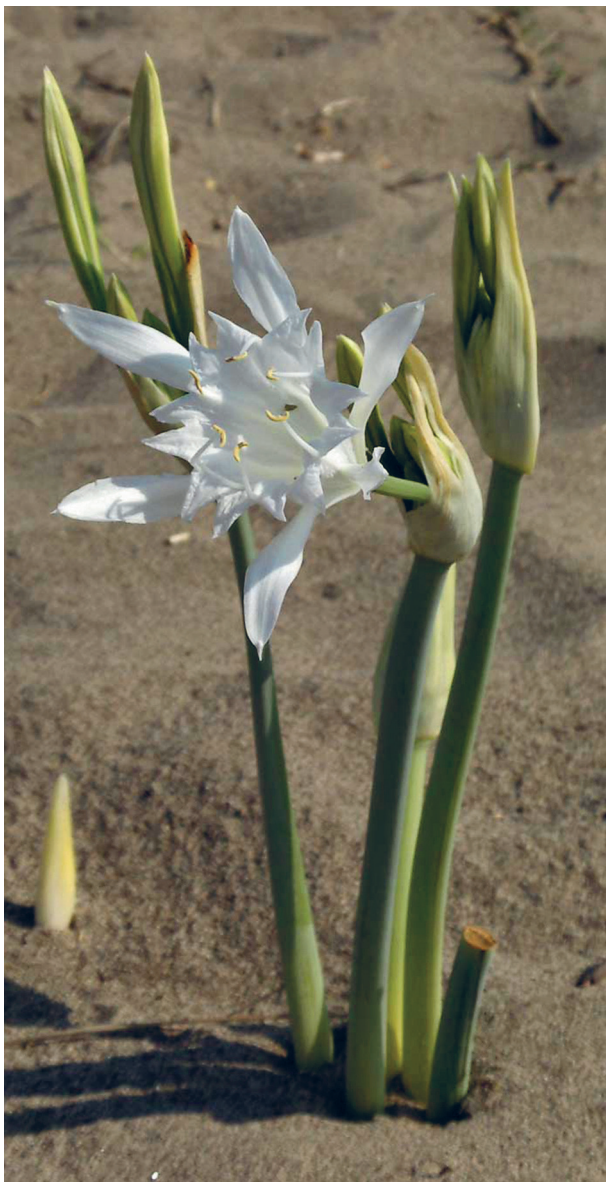
Fig. 3. Pancratium maritimum (family Amaryllidaceae). Photo taken July, 2006, at Paestum, Campania, Italy, by Stemonitis; reproduced via Wikimedia Common.

same as the Classical Hebrew shūshan or shōshannā , 20 and that this plant is often said to be the white lily ( Lilium album ). 21 Forsskål further notes: “Its similarity is great with this Pancratium as in pure whiteness