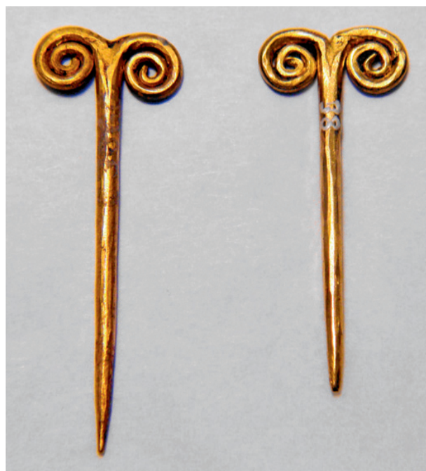
Fig. 9. Gold pins with double-spiraled heads. Varpelev, grave 'a' and Vrangstrup, grave 1.

In Southern Scandinavia, the Varpelev prince appears to have preserved a regional network, at least across the area represented by present-day Denmark. An indication of this is seen, for example, in the gold pins with double volutes from Varpelev grave a, and Vrangstrup grave 1 from the eastern part of Central Jutland (fig. 9) (Lund Hansen 1987, 428). In Vrangstrup grave 5, there was a Roman ring not unlike that from Varpelev grave alpha, though with a blue stone. This grave also contained a faceted glass. The most obvious example is, however, the Årslev grave on Funen, with which there are several links. Not least of these are there strong bonds to SE Europe (Storgaard 2003, 121ff), but the trilobate hair pins from Varpelev grave alpha and from Årslev, in particular, support this conclusion (fig. 10). When we speak of Southern Scandinavian connections with the Romans and SE Europe, we are unable to ignore the first rich hoards of precious metals from Boltinggård Skov and Brangstrup (Henriksen 1992; Henriksen & Horsnæs 2006). Both finds have their earliest coin from the reign of Trajan Decius (AD 249-251) and their latest from Constantine the Great, minted in AD 335/6. The geographic distribution for the origins of the coins