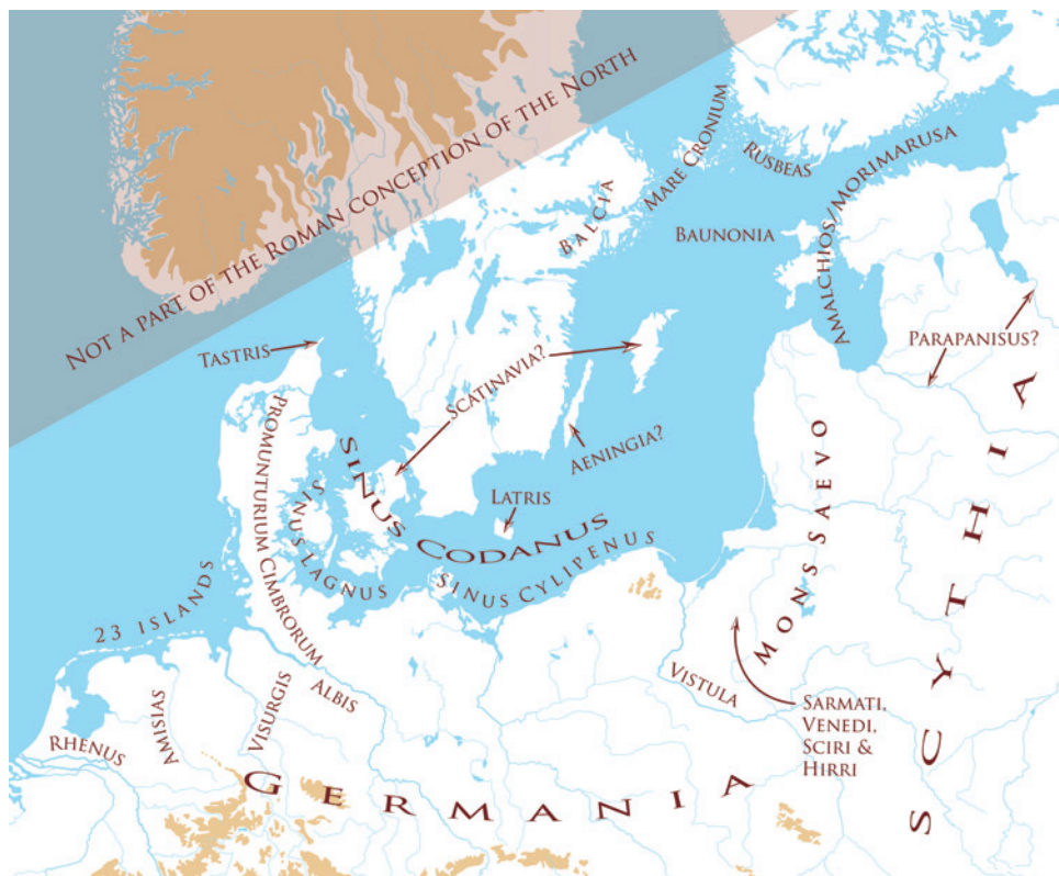
Fig. 2. Map of northern Germania according to Pliny the Elder. Author's interpretation. For a translation of the full text mentioning all place names on the map, Pliny NH 4.94-97 see Grane 2007a, appendix 1.

This leads to the conclusion that the information actually makes very good sense. It is of course necessary to add the further information which can be deduced from Ptolemy, Marcianus and Solinus from the 2 nd , 3 rd and 4 th centuries AD. 2