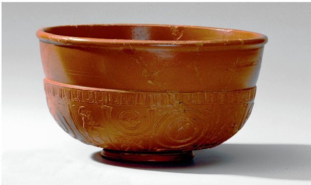
Fig. 4. Himlingøje, grave 1980-25. Terra sigillata bowl, Dragendorf 37, used as urn.