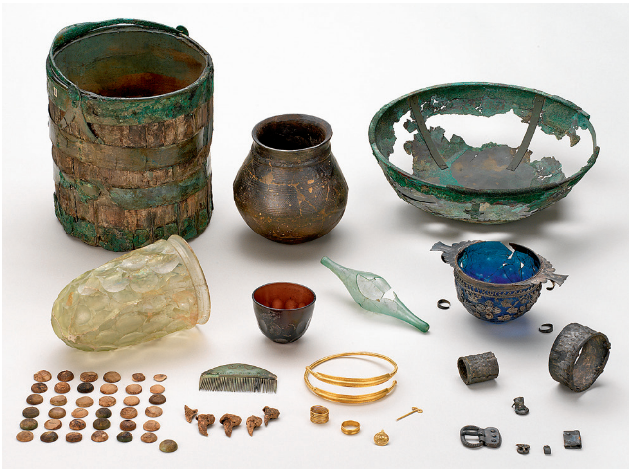
Fig. 7. Varpelev, grave 'a'.

In addition to the obvious symbols of princely power, a snake's head arm ring, two gold finger rings, a gold pin and the gold coin, the man was also buried with a Roman bronze basin and six glass vessels (fig. 7). Among the latter, presumably of Syrian origin, was a kantharos of blue glass in an open-work silver frame with a Greek inscription meaning