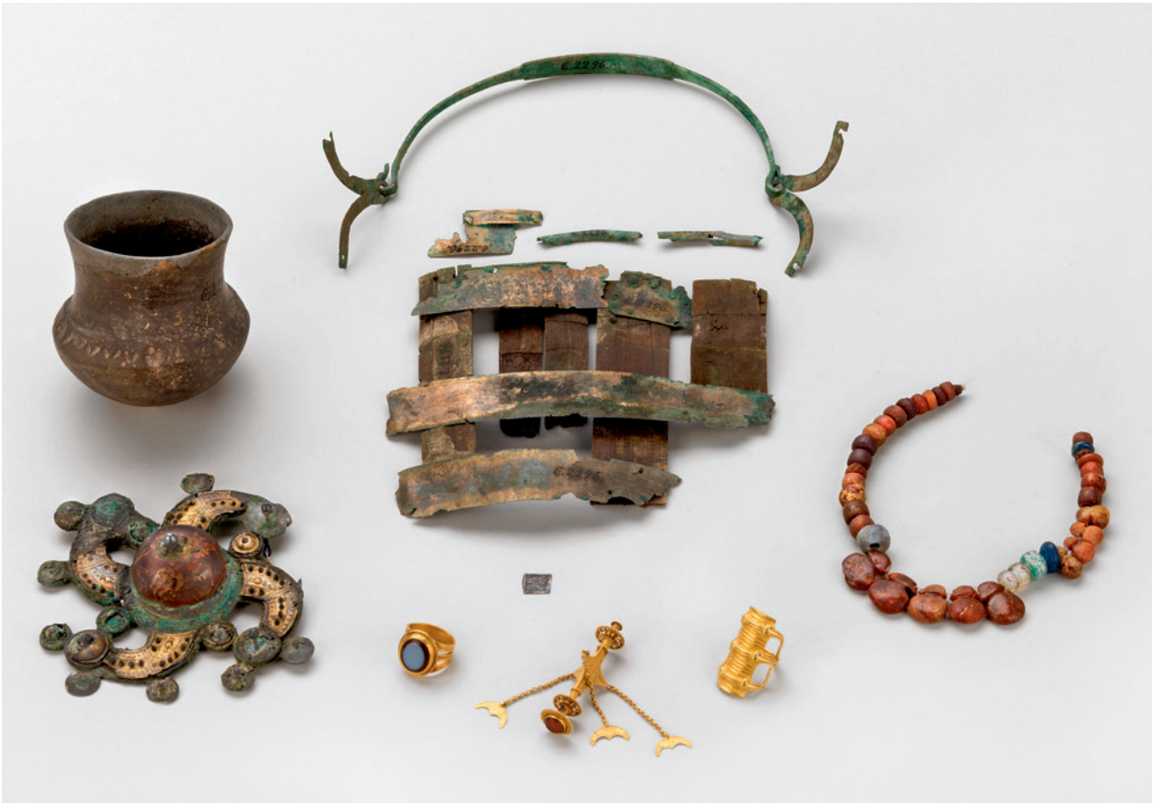
Fig. 8. Varpelev, grave alfa.

‘for your happiness’, together with a phial which could have held perfumed oil to be used in the burial. Within the Roman Empire, these types of glass vessels were associated with cults that celebrated a life after death, such as Christianity and the Bacchus cult (Cool 2002). Three glass vessels were faceted, whereas one could not be identified.