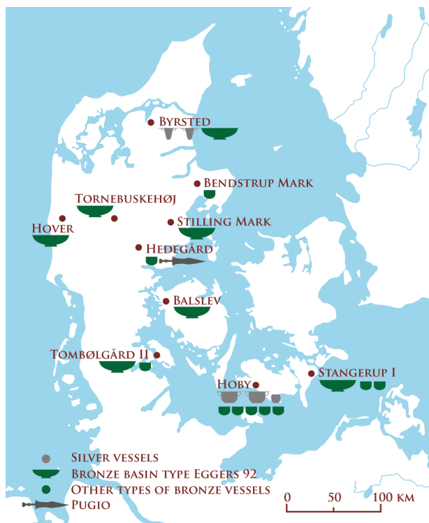
Fig. 1. Map of graves from period B1a (AD 1 - 40) containing Roman objects.

In the subsequent period, B1b (AD 40-70), a fall is seen in imports in Denmark, after which they increase dramatically in B2 (AD 70-150/60), only to decline again in C1a (AD 150/60-210/220). During the same period, a series of events took place of great relevance for the Romans' actions towards their Germanic neighbours. In AD 39-40, the Emperor Caligula set about launching an invasion of Britannia . When he reached the English Channel, he ordered the army to draw up into battle formation and attack the sea. He then ordered the soldiers to gather sea shells on the beach as war booty, after which he returned to Rome (Sueton, Caligula 46). His successor, Claudius, who came to power in AD 41, badly needed a military success. So, in AD 43, rather than throwing himself at the, seen in historical perspective, somewhat problematic Germania , he began a conquest of Britannia . In AD 47, a direct order came from the Emperor to Gnaeus Corbulo, legate for the Lower Rhine army, to withdraw all troops to the Rhine (Tacitus, Annales 11.7, 19). This means then that the Romans' interest in Germania declined precisely during this period when we can see a corre-