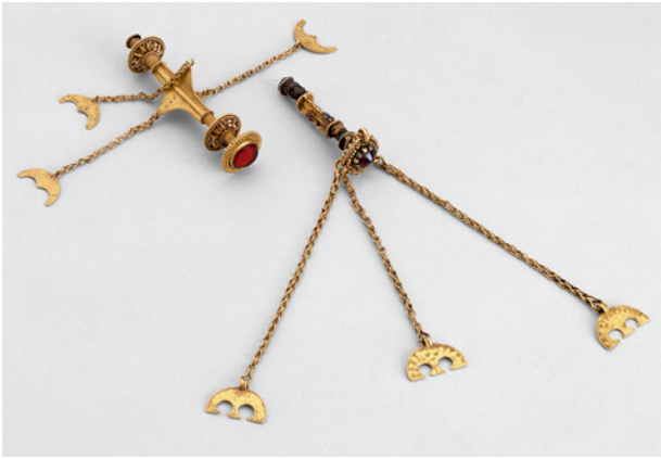
Fig. 10. Gold pins with pelta shaped pendants. Varpelev, Grave alfa and Årslev.