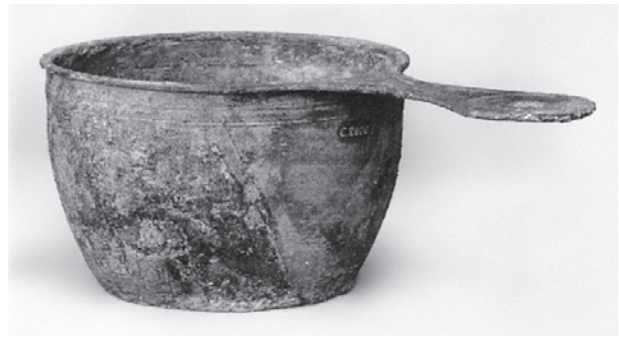
Fig. 3. Himlingøje, grave 1875-10. Roman trulla , E 142 used as urn.

As already mentioned, the Himlingøje dynasty will, as such, not be entered into in great detail here, but I would like to look a little more closely at the two founder graves, graves 1875-10 and 1980-25. They