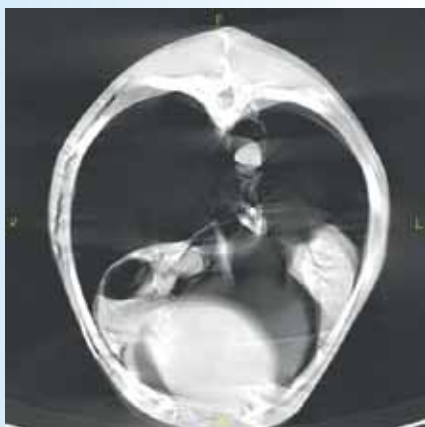
Figure 2. A transverse CT of the caudal thorax displayed in a lung window (with 1600 HU, center – 600 HU). Slice thickness: 5 mm. Patients' right side is to the left of the image. The pleural and mediastinal space is gas-filled. The lungs are markedly collapsed and consolidated. Some subcutaneous emphysema is seen in the right thoracic wall (due to previous thoracocentesis). A large bulla (3 cm in diameter) is seen in the caudal part of the right caudal lung lobe.

(13). Recently, pulmonary thromboembolism was identified as the cause of spontaneous pneumothorax in a dog with pituitary-dependent hyperadrenocorticism (14). Identification of the underlying cause is important for the prognosis and treatment of pneumothorax.