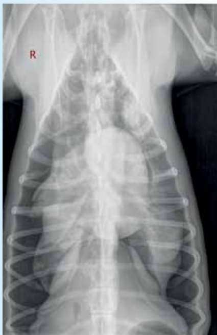
Figure 1. Dorso-ventral thoracic radiographs. There is bilateral pneumothorax with collapse of all lung lobes. In the periphery of the right caudal lobe, there is a roughly circular radioluscent zone, interpreted as a pulmonary bulla.