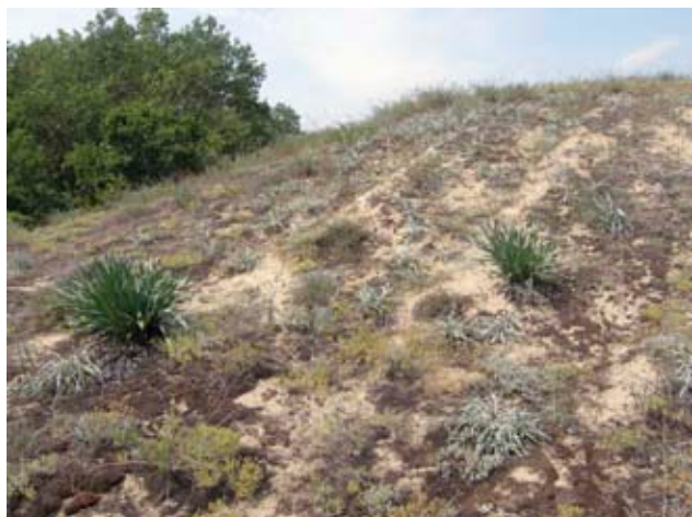
Fig. 10. Pancratium maritimum.

Kamchia river mouth, 43.00128°N, 27.88843°E, 05.06.2012, coll. A. Petrova & R. Vassilev (SOM 168669).