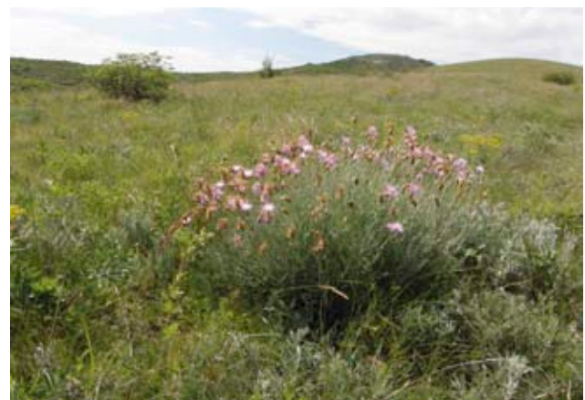
Fig. 8. Centaurea trinervia.

A Critically Endangered species in Bulgaria, known with a very limited number of individuals from the neighboring Taushan Tepe hill (Petrova 2011a). Here only few single individuals were observed. The relic Centaurea jankae Brandza, known from Taushan tepe, was also found at Tepichkite hills.