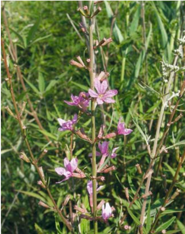
Fig. 3. Lythrum virgatum.

New for the N Aegean area and confirming report by Katsikopoulos (1936: 7).