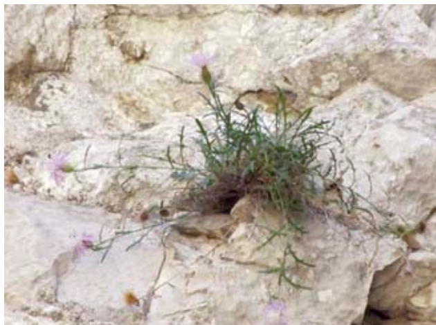
Fig. 1. Centaurea kamciensis.

Centaurea kamciensis is a Bulgarian endemic, one of the rarest species in the Bulgarian flora. It was collected in the same locality on 13.07.1962