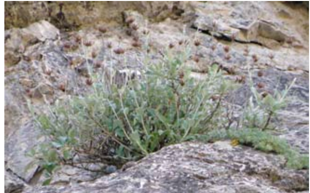
Fig. 20. Staehelina uniflosculosa.

New for Mt Killini. Recorded from Mt Chelmos but not from the other mountains in the Peloponnese. The tufts were out of reach on a high vertical limestone rock face together with Asperula arcadiensis . Campanula asperuloides was noted in the shady crevices at the base of the rock, forming attractive little clusters of purplish-blue.