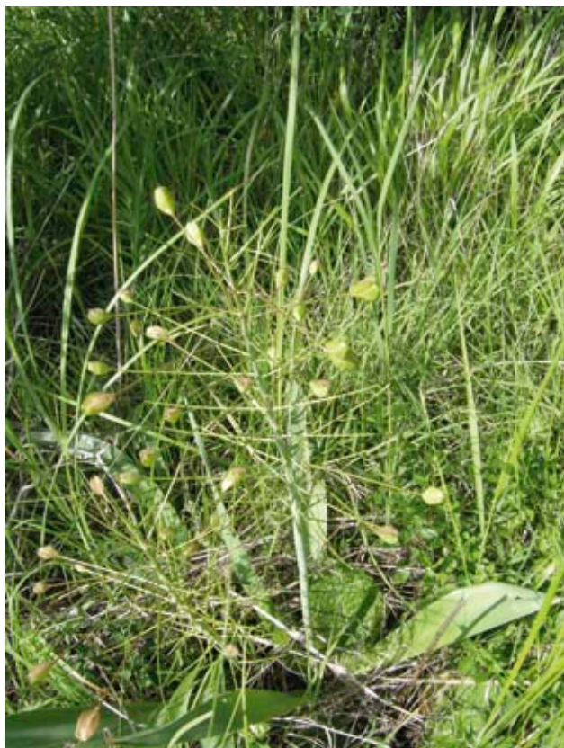
Fig. 11. Bellevalia sarmatica.

New for the floristic region. Bellevalia sarmatica is a Pontic geoelement in the Bulgarian flora. It is evaluated as Critically Endangered for Bulgaria (Petrova 2009). The species has a scattered distribution and, up to now, was known only from the coastal area between Rusalka resort and Balchik town in Bulgaria – floristic subregion Northern Black Sea Coast. Here a small population of few individuals was observed.