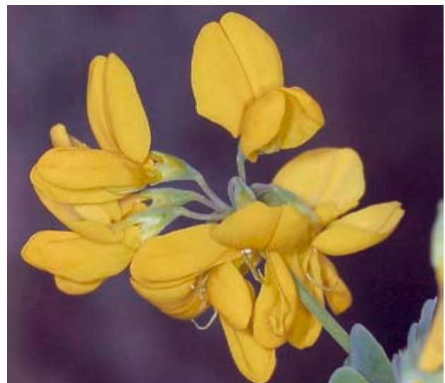
Fig. 14. Coronilla valentina subsp. glauca.

Gr Nomos & Eparchia Attikis: southeastern slope