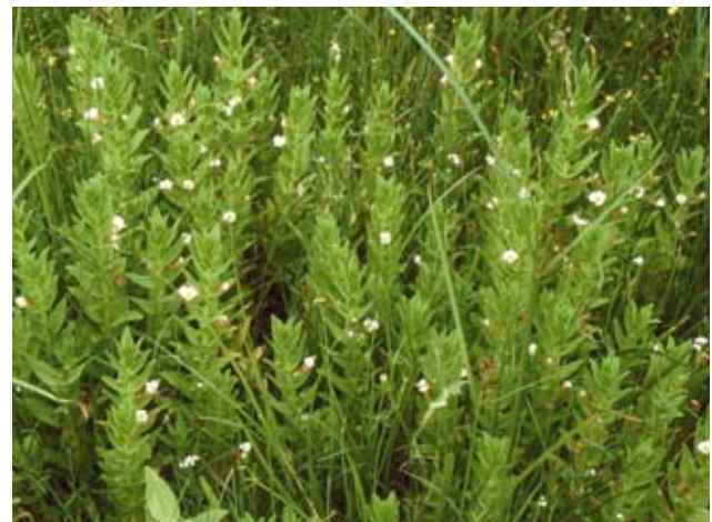
Fig. 6. Gratiola officinalis.

Gr Samothraki: NE of Therma, large coastal wetland in alluvial forest, 3 m, 40°29'00"N, 25°37'06"E,