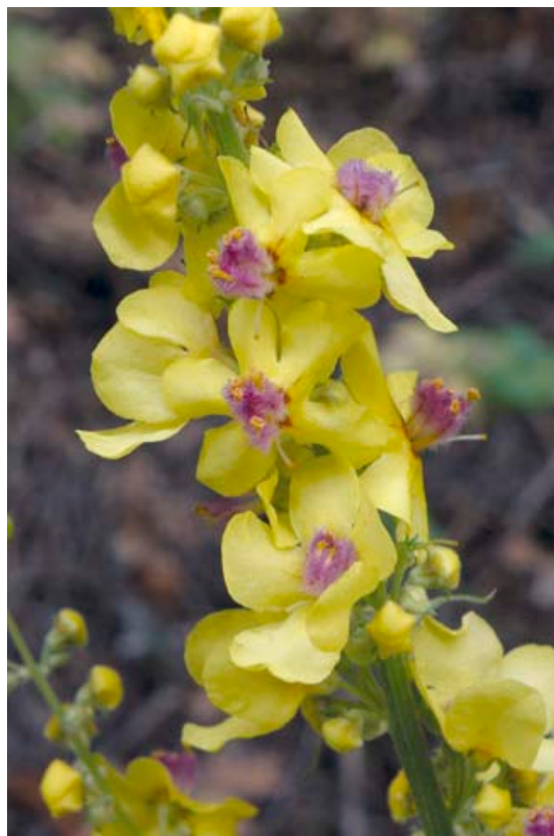
Fig. 25. Verbascum nigrum subsp. abietinum.

Gr Nomos & Eparchia Korinthias: Mt Killini,