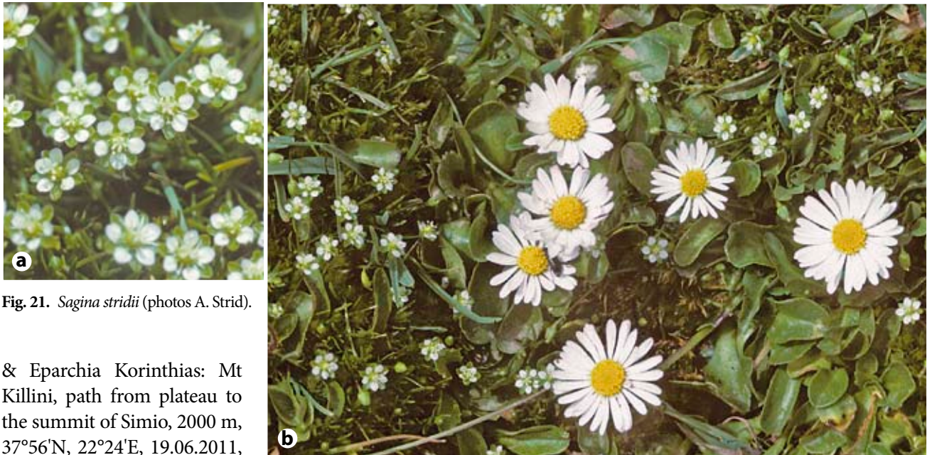
Fig. 21. Sagina stridii (photos A. Strid).

& Eparchia Korinthias: Mt Killini, path from plateau to the summit of Simio, 2000 m, 37°56'N, 22°24'E, 19.06.2011, Zarkos & Christodoulou obs. (photos.); loc. ibid. , 24.6.2012, Zarkos & Christodoulou s.n. (holotype C).