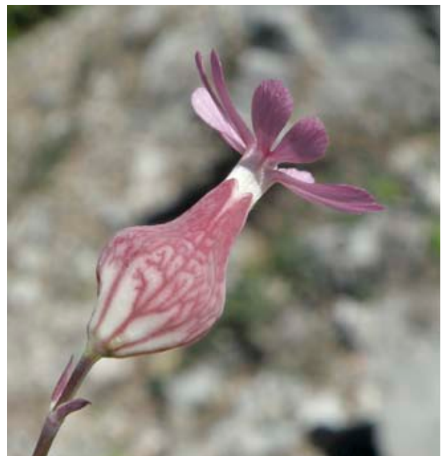
Fig. 22. Silene reinholdii.

New for Mt Saitas and second record from north central Peloponnese. The species has been reported only once in 118 years from Nomos Achaïas (Vouraikos gorge near Megaspileo, Halácsy 1894: 499) and not elsewhere in north central Peloponnese. The plants were identical to those collected at Akrocorinthos. When this paper was submitted, we were unaware that the species had also been noted on the south side of Mt Saitas, near the village of Daras (unpubl. data, pers. comm., D. Mermygkas July 2012).