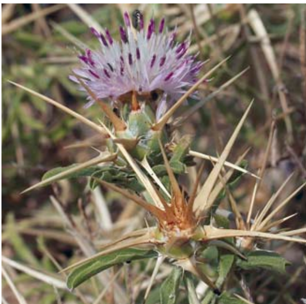
Fig. 13. Centaurea iberica subsp. holzmanniana.

New for Mt Pateras. Identical to the plants collected on Parnitha between Tatoi and Ag. Mercurios by Timoleon Holzmann & Heldreich in July 1878 (C!). Endemic to C and S Greece, distinguished from C. i. subsp. iberica by the lower stature, prostrate-ascending stems and longer apical spine on the phyllaries.