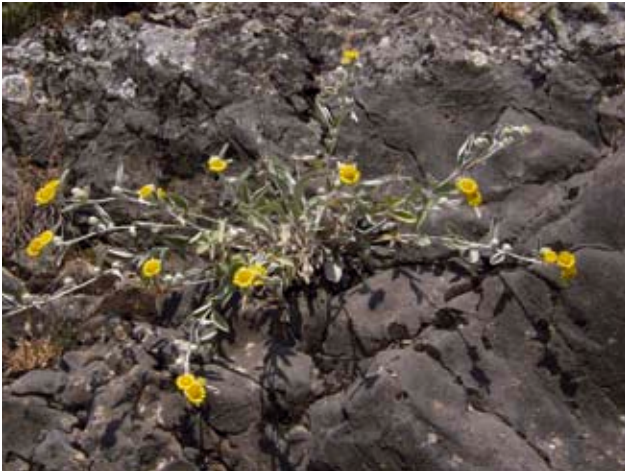
Fig. 9. Inula aschersoniana.

A Balkan endemic, quite common in the limestone areas in Bulgaria, but not given for the region in the contemporary floristic sources (Peev 1992; Delipavlov 2003; Assyov & Petrova 2006).