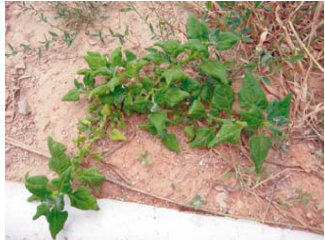
Fig. 16. Tetragonia tetragonoides.

New for Mt Pateras. Approximately 10 plants observed at edge of cultivated field together with Bellevalia ciliata and Ornithogalum nutans .