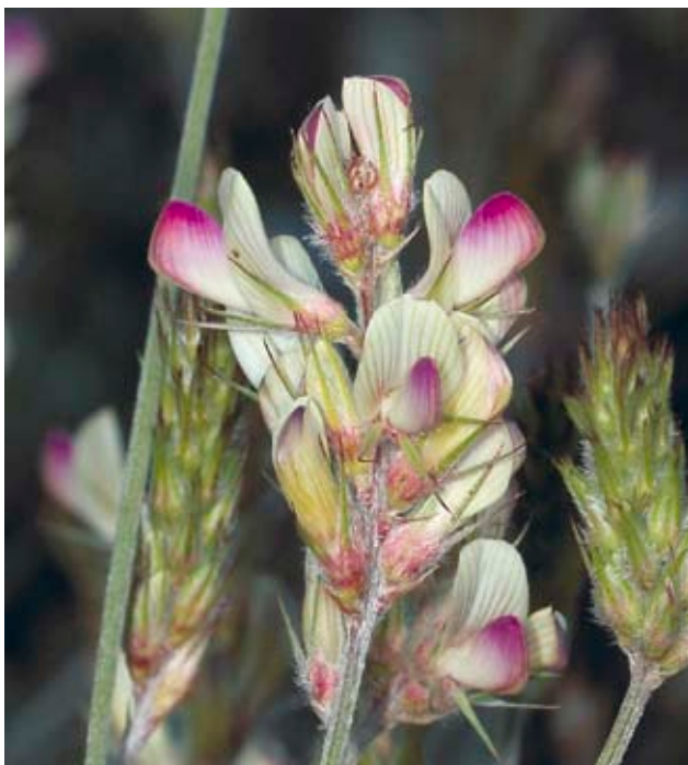
Fig. 15. Onobrychis arenaria subsp. lasiostachya.

First collected on Mt Pendeli by Halácsy in May 1886 (type of O. halacsyana Heldr.); apparently no later gatherings. A small population of ca. 15 individuals was noted along the main road to the summit.