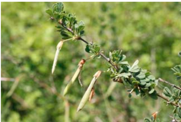
Fig. 19. Caragana frutex.

Acknowledgements. The author is grateful to the European Commission's Life+ Programme for the financial support of the project LIFE08 NAT/BG/000279.