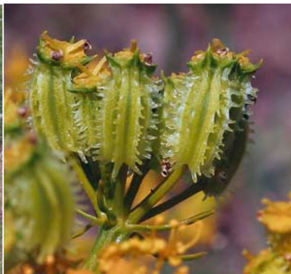
Fig. 12. Cachrys cristata.