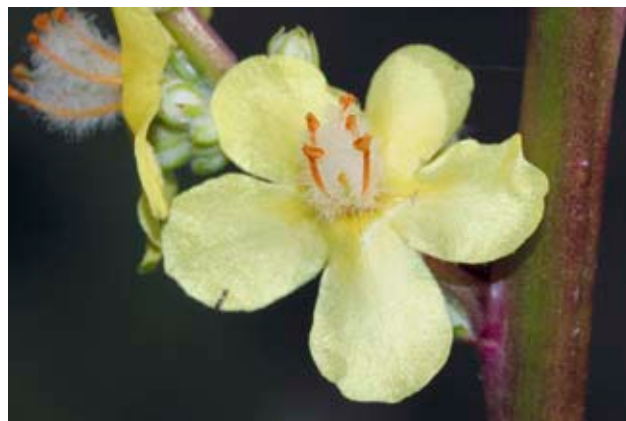
Fig. 24. Verbascum banaticum.

New for Mt Killini and Nomos Korinthias. This is also the first record for the Peloponnese, representing the southernmost occurrence of the species in the Balkans. The nearest locality is reported as