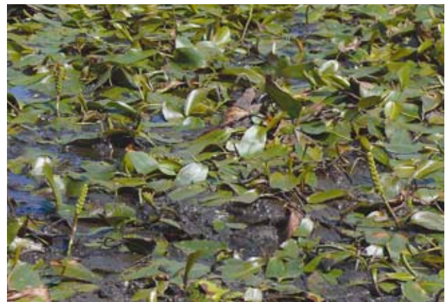
Fig. 4. Potamogeton nodosus.

Recorded from Limnos. Det. van der Weyer, March 2012; identity conf. Kaplan, March 2012.