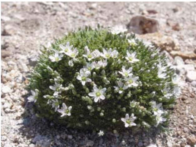
Fig. 2. Minuartia recurva.

Gr Samothraki: SW of Therma, cushion phrygana on rocky ridge NW of Fengari peak, 1580 m, 40°27'48"N, 25°35'04"E, 26.06.2007, Biel 07.273; loc. ibid. , 20.07.2009, Biel 09.265; S of Therma, open cushion phrygana at Louloudi plateau, 1470 m, 40°26'56"N, 25°35'56"E, 19.06.2008, Biel 08.279; loc. ibid. , 23.07.2009, Biel 09.298; S of Therma, open cushion phrygana at Louloudi, SE ridge, 1380 m, 40°26'56"N, 25°35'56"E, 23.07.2009, Biel 09.297.