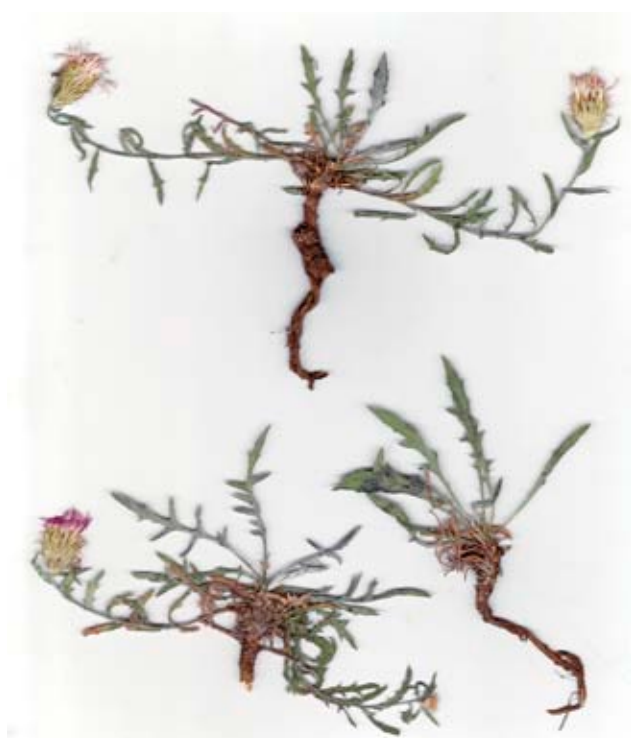
Fig. 18. Centaurea kamciensis.

Centaurea kamciensis was described by the Bulgarian botanists Kočev and Gančev (1968). The only herbarium sheet preserved in the Bulgarian herbaria is the type specimen (SOM 87502). Bearing in mind the single gathering of the species, so far C. kamciensis has been considered an unresolved taxon. Therefore, it is lacking from the contemporary field guides on the Bulgarian flora. The species is a Bulgarian endemic and is included in the Atlas of Bulgarian Endemic