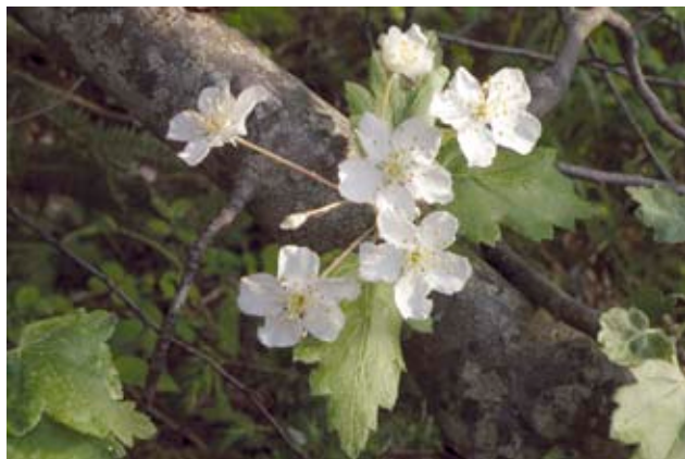
Fig. 23. Malus florentina.

New for Nomos Korinthias. In the Peloponnese recorded only from Nomos Ilias, Nomos Achaïas and Nomos Arkadias (Mt Parnonas). Together with Malus florentina and associated species (see above entry).