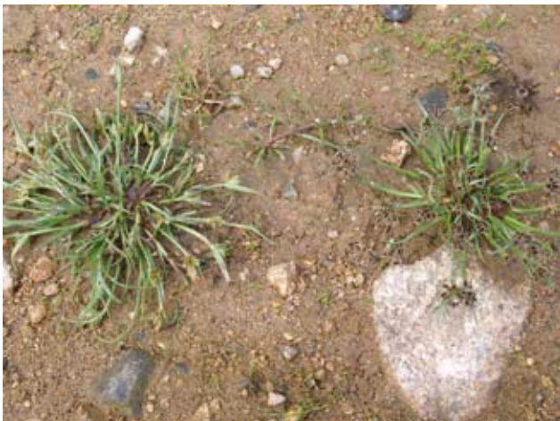
Fig. 7. Pycneus flavescens (left) and Cyperus fuscus.

New for the N Aegean area. Mainly in permanently wet places (5 separate gatherings).