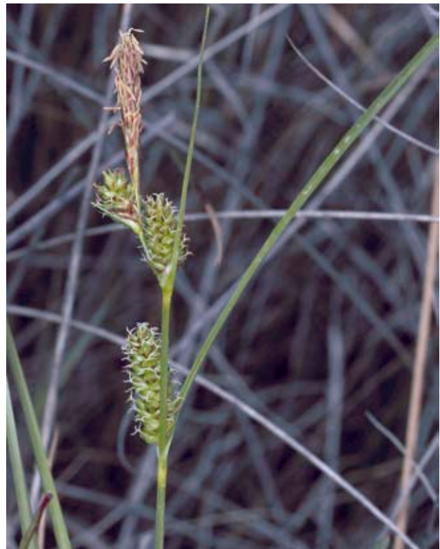
Fig. 17. Carex extensa.