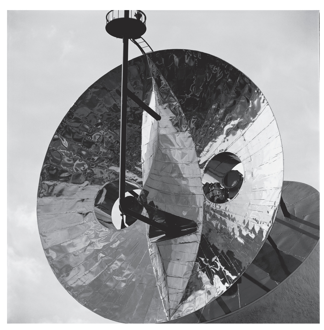
Kenji Yanobe Atom Suit Project: Tower of Life 4 (2003).

taken place only a short time before his conversation with the Eyeball Man took place in March 2003.