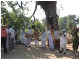
Conference Chotro II. Welcome to Tejgadh